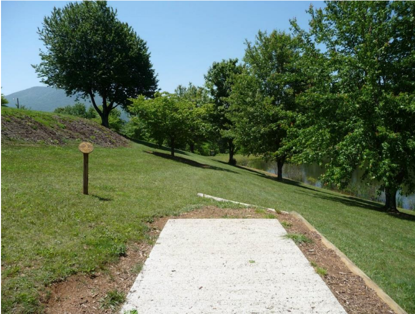
Figure 2 Conceptualization of Tee Pad and Signage

Signage (see Figure 2) at each location will consist of a 4 inch by 4 inch sign post placed in a 12 inch wide by 12 inch deep hole. The hole will be filled with concrete to secure the post.