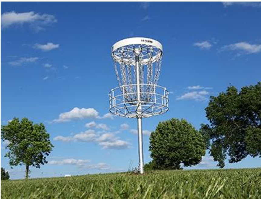
Figure 3 Conceptualization of Disk Golf Basket

There will be a total of 18 baskets (see Figure 3), one for each hole shown in Figure 1. A 12 inch wide by 12 inch deep hole will be dug to place the basket post. The hold will be filled with concrete to secure the post. Above ground baskets will be used at Holes 10 and 18, resulting in no ground disturbance for their placement.