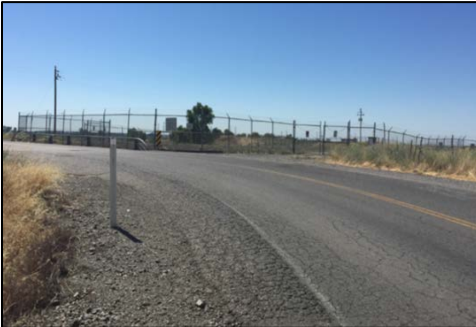
View to south at Canal Milepost 43.17.