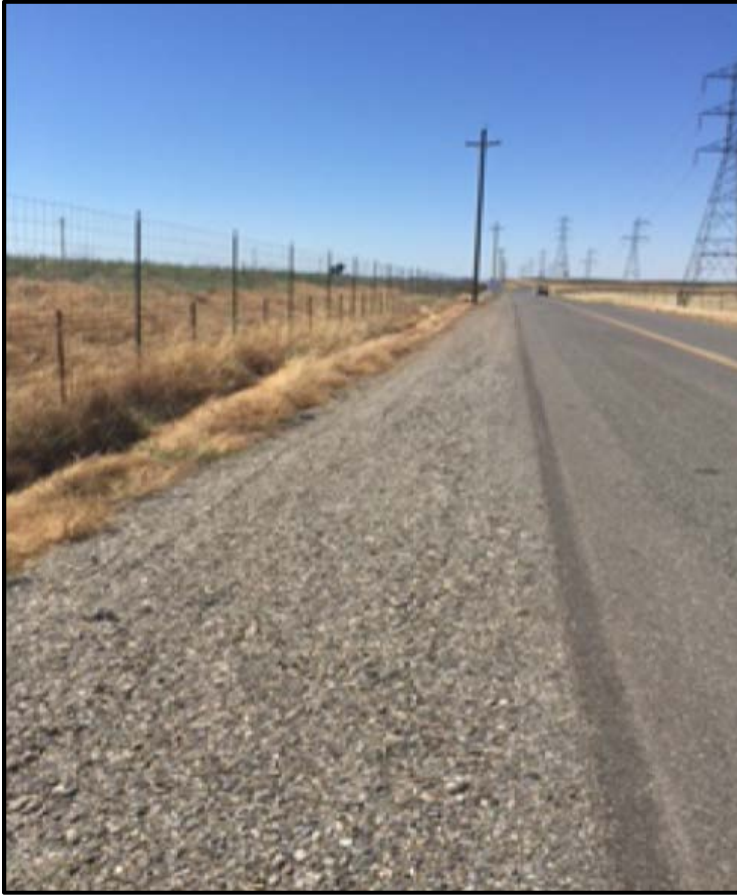
View to south at PG&E's pole line along CR 33 where 21 kv line will be attached outside Reclamation's fenceline.