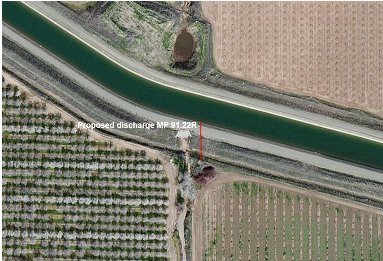
Figure 1. Aerial view of the proposed pipeline from the groundwater well to the new discharge facility at MP 91.22R.