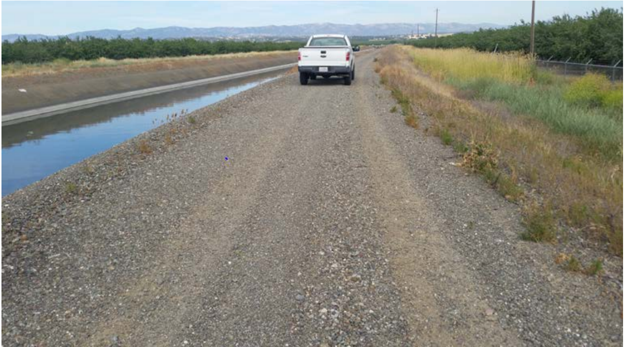
Figure 3. Image looking west from the O&M road along the Tehama Colusa Canal at Milepost 91.22R showing Kalfsbeek property to the right.