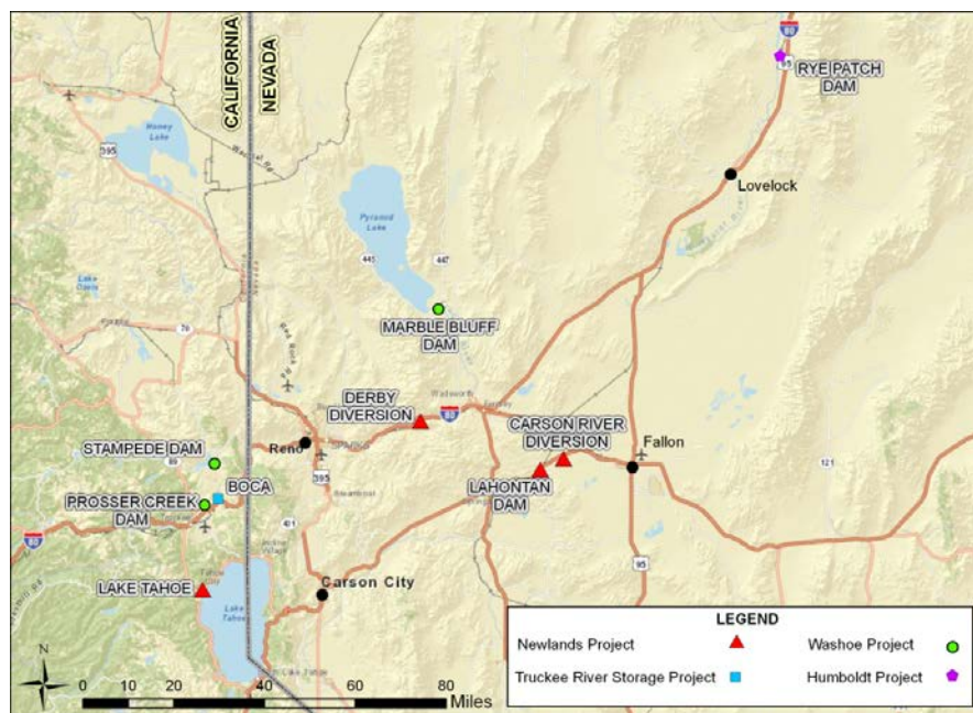
Figure 1. Bureau of Reclamation Lahontan Basin Area Office Projects and Facilities in California and Nevada, including the Carson River and Derby Diversion Dams in the Newlands Project.

The Newlands Project (Project) was initiated by the Bureau of Reclamation (Reclamation) in 1903. It provides water from the Carson and Truckee Rivers for irrigation of approximately 57,000 acres in the Lahontan Valley near Fallon and Fernley in western Nevada (Figure 1). Dam tender houses were built by Reclamation to provide on-site housing for the operators of the diversion dams associated with the Project. The Truckee-Carson Irrigation District (District) has been operating and maintaining these dams and many other Project facilities and infrastructure under Reclamation contracts since December 31, 1926 (Contract No. 11r-93; and Contract No. 7-07-20-X0348, November 25, 1996). The District is a quasi-municipal political subdivision of the State of Nevada. The dam tender houses were previously used by the District and remain under Reclamation ownership, but they are no longer needed by the District or Reclamation for Project purposes.