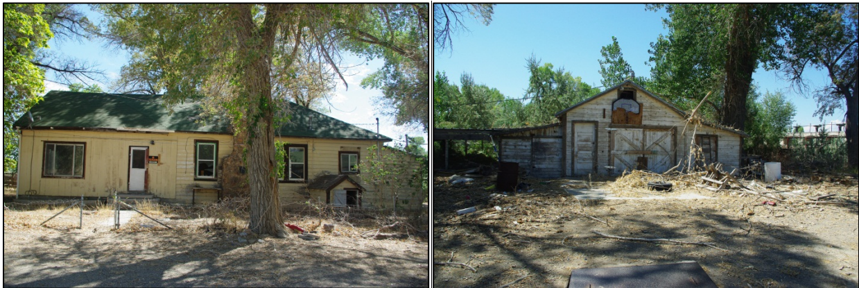
Figure 2. Carson River Diversion Dam tender house (left photo) and garage (right photo, with Dam in background at right), Churchill County, Nevada.

The Carson House is located at 12255 Pioneer Way, Fallon, Nevada 89406 (Figure 2). It was constructed by Reclamation in 1910 (Reclamation 2002). This one-story house is wood-frame construction on a concrete slab foundation (Reclamation 2002). The original structure has had additions constructed as recently as 1981 (Reclamation 2002; R. Jardine, District, in litt. 2012). The size of the house is reported to be 1,782 square feet (ft 2 ) (Reclamation 2002). Also present on the property are a 747.5 ft 2 detached garage constructed in 1910 (Reclamation 2002), a corral, sheds, power poles/lines, and fencing of various types. Prior on-site actions by the District include the removal of potentially hazardous materials from the property, termination of electrical service to the house, and removal of a propane tank (R. Jardine, District, in litt. 2012). However, the property is strewn with miscellaneous trash and debris, and a septic system remains on site.