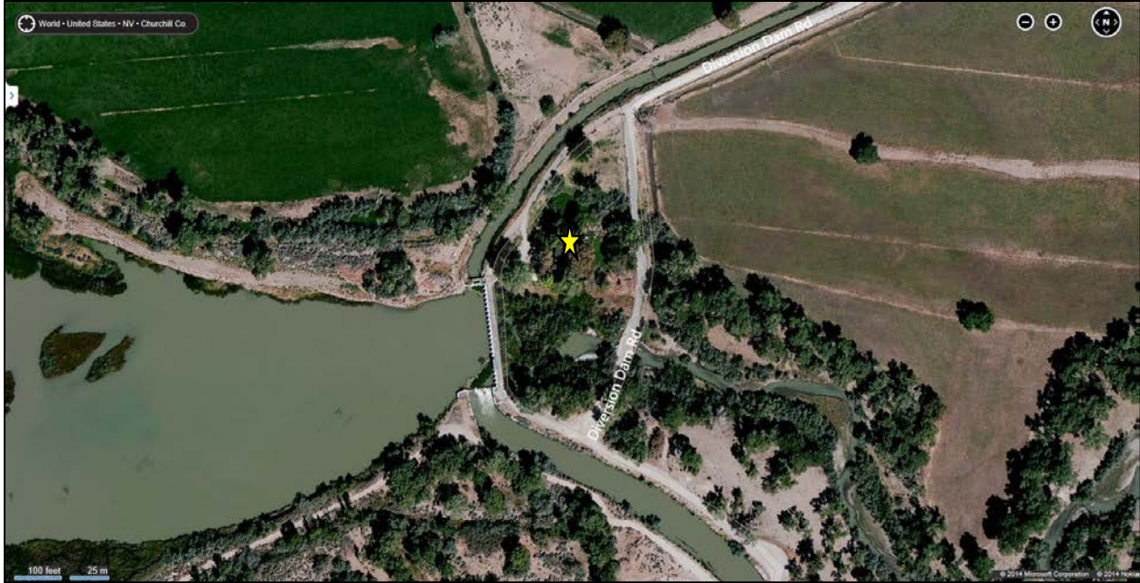
Figure 3. Carson River Diversion Dam tender house site (★) with Carson River Diversion Dam (center), T-Line Canal (upper center), Carson River channel (center), and V-Line Canal (lower center), Churchill County, Nevada.