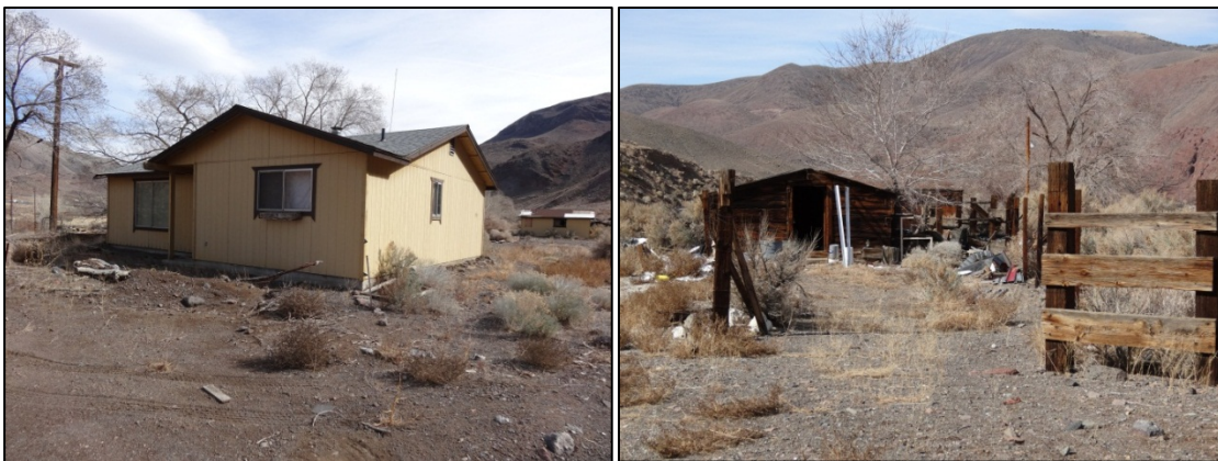
Figure 4. Derby Diversion Dam tender house with garage/bunkhouse in background at right (left photo) and outbuildings (right photo), Storey County, Nevada.

The Derby House is located at 999 West Canal Road, Sparks, Nevada 89434 (Figure 4). It was constructed by the District in 1982–1983 after the original Reclamation house was destroyed by fire. This one-story house is wood-frame construction on a concrete slab foundation (Reclamation 2002). The size of the house is reported to be 908 ft 2 (Reclamation 2002). There are multiple other structures on the property including a 432 ft 2 detached garage/bunkhouse constructed by the District when the Derby House was rebuilt (Reclamation 2002), two older sheds/outbuildings, a chicken coop, two well houses, and a corral and other fencing. The District previously arranged for removal of miscellaneous materials and debris from the Derby House property (R. Jardine, District, in litt. 2012).