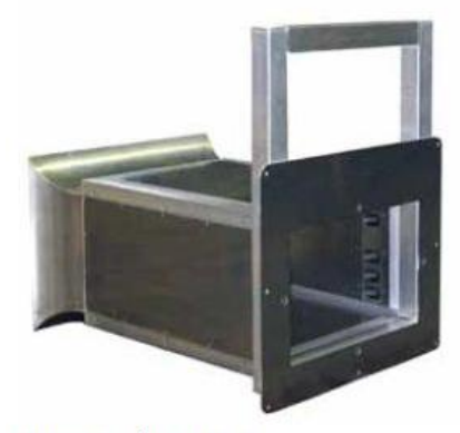
Figure 2 - Slip Meter