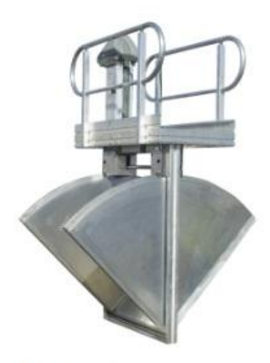
Figure 4 - Flume Gate

4. SCADA Interface Rubicon Units: MID's contractor would install the telemetry devices at each location to provide remote control capabilities and communication to the SCADA master station. There would be a radio and antenna installed at the three flume gate modernization sites, the 14 new flume and slip meters, as well as at three existing flume gates (Franchi Dam, Main I Head, and Main II at Bishel Weir) and the existing Lateral 32.2 Basin Pump Station. After the flow meters and gates are installed and the master station is set up at MID's main office, the contractor would install the telemetry devices at each site then integrate into the SCADA system. This is a modular activity and the contractor would use hand tools to complete it. Each installation would take approximately one to two days.