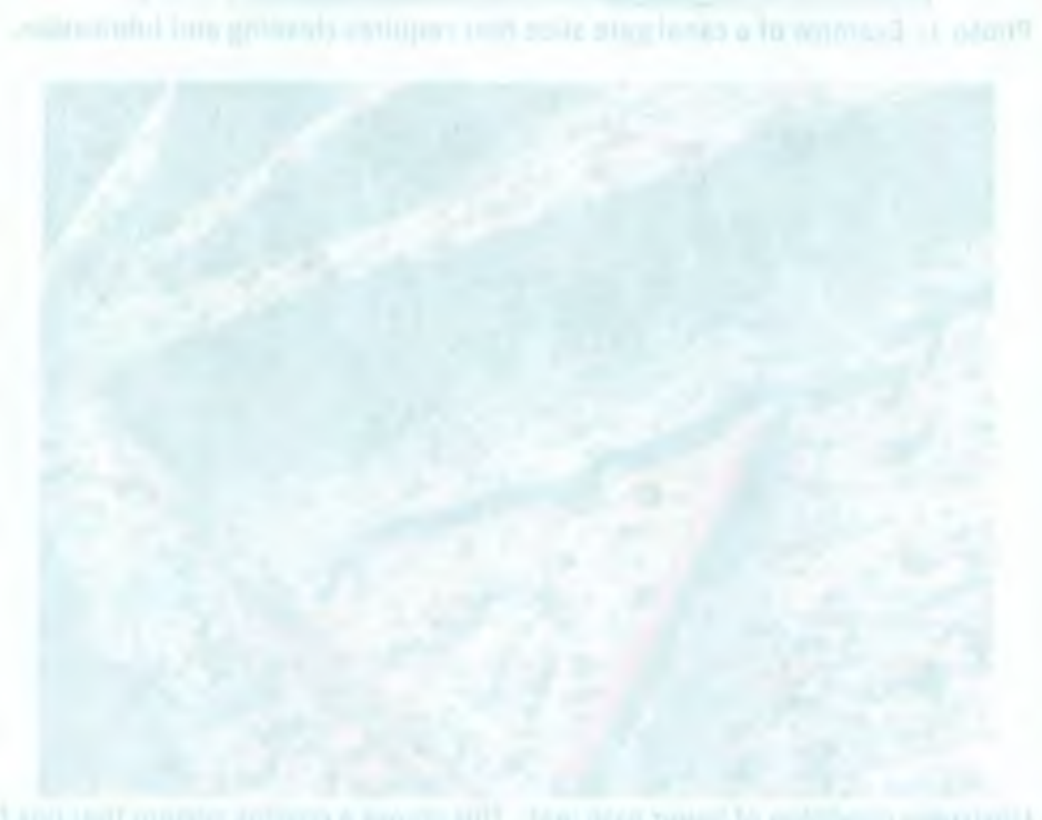
Photo 31 Allerication candifien at lower 3210 (east, 1100 encode a control marcon that the france with