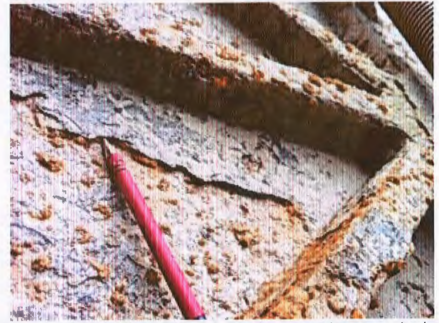
Photo 2: Upstream condition of lower gate leaf. This shows a coating system that has failed with excessive corrosion.