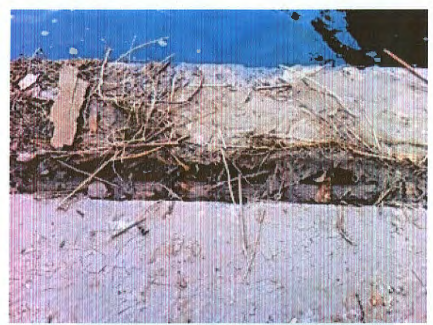
Photo 3: Typical condition of a canal gate seat embedded in the sill board. Note how seat has broken down and decayed.