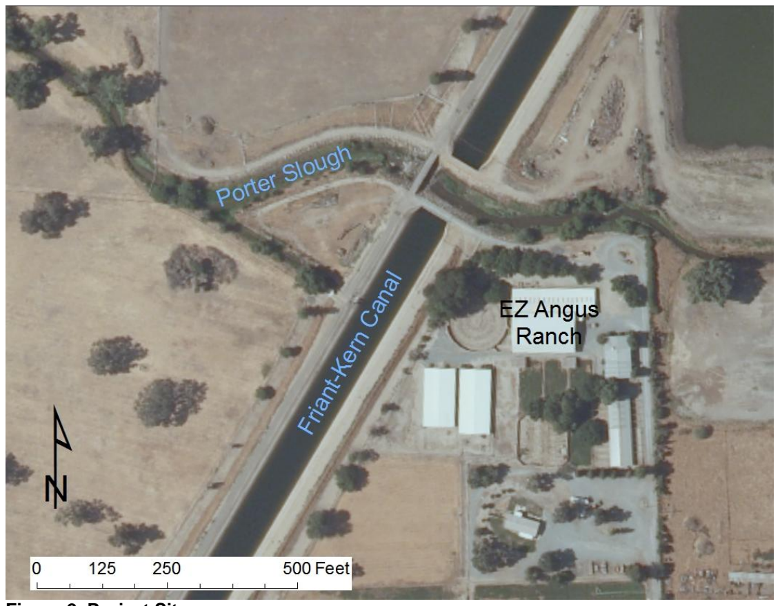
Figure 2 Project Site