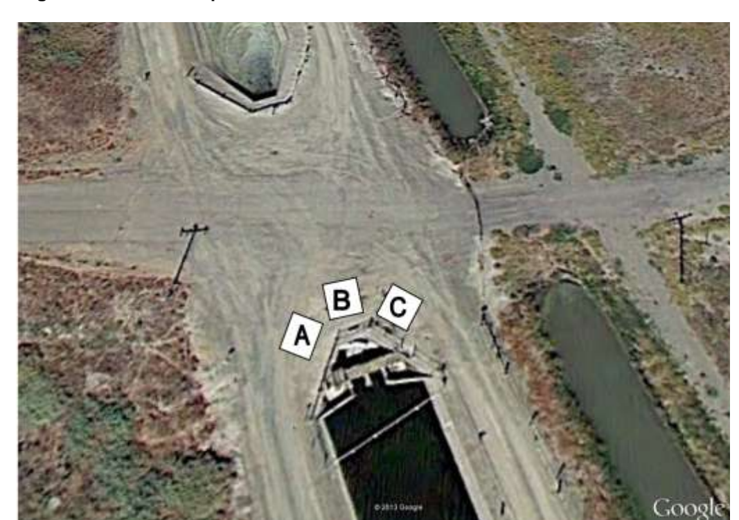
Figure 1 Potential Proposed Action sites

Three potential sites are considered at this time (A, B and C Figure 1). The exact location will be determined with the San Luis & Delta-Mendota Authority to avoid obstructing maintenance or other activities that may take place along the bridge/check structure.