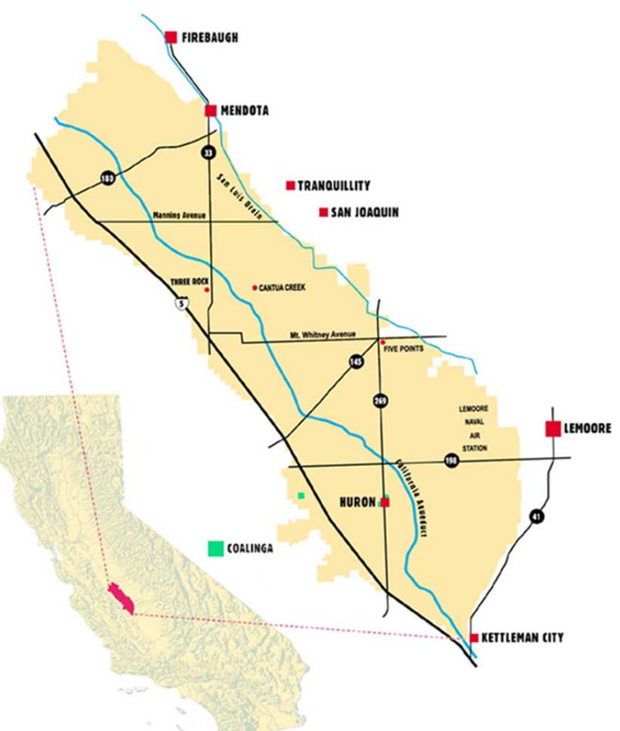
Figure 1: Westlands Water District

Placer County Water Agency (PCWA) has implemented several temporary water transfers over the past 25 years to enhance water supply, water quality, and environmental conditions. In response to the low allocations