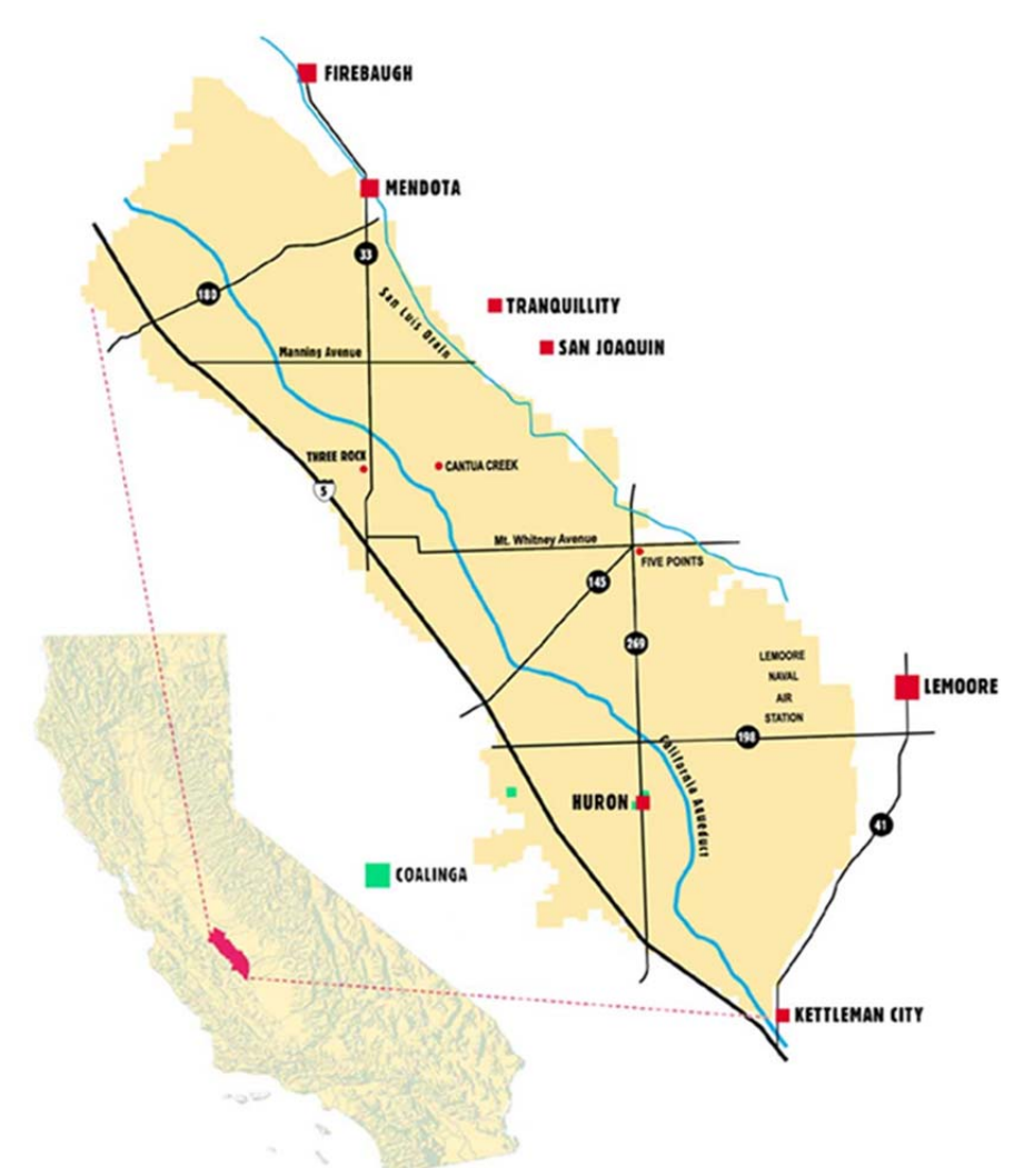
Figure 1: Westlands Water District

Placer County Water Agency (PCWA) has implemented several temporary water transfers over the past 25 years to enhance water supply, water quality, and environmental conditions. In response to the low allocations