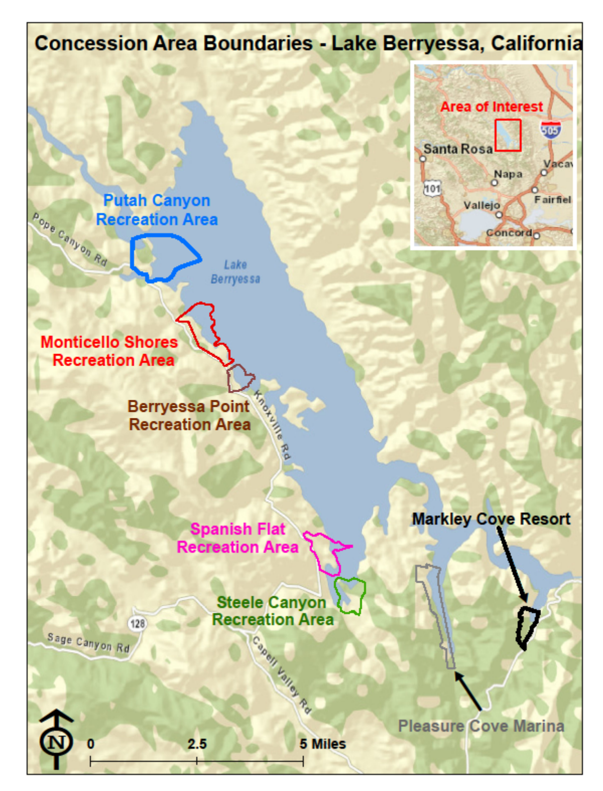
Figure 1: Lake Berryessa Concession Areas