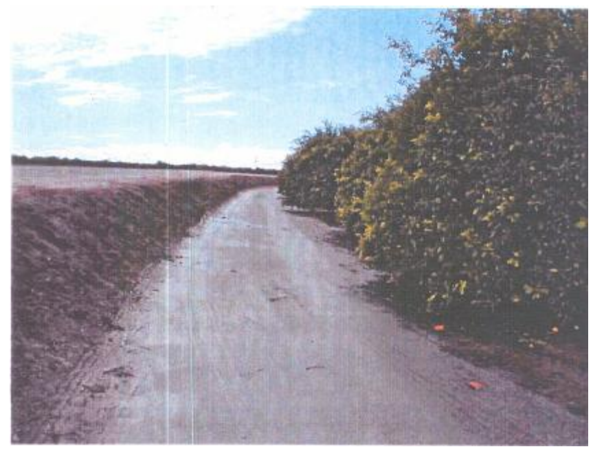
Figure 1 Orange Trees in the Friant-Kern Canal Right of Way

ITA Designee concurred with Item 11. Their determination has been attached