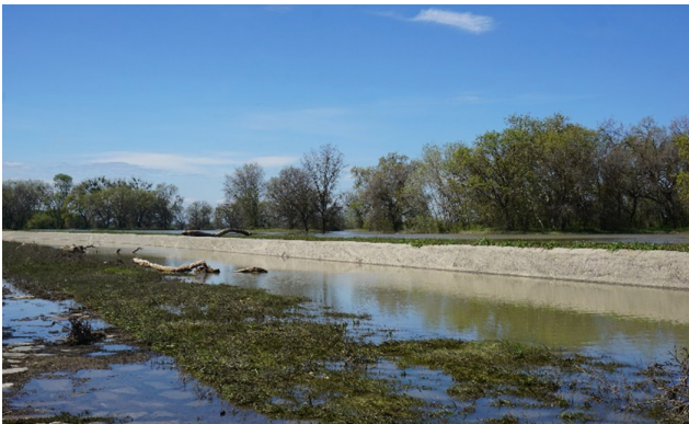
The Fremont Weir at the northern end of the Bypass is a 1.8-mile-long concrete structure designed to divert winter-and-spring Sacramento River floodwaters away from the city of Sacramento and outlying communities.

In the 1900s, the state of California and the U.S. Army Corps of Engineers developed a series of structures to protect Sacramento and the Central Valley from floods. The Bypass, a prominent feature of the Flood Control Project, is a leveed 59,000-acre engineered floodplain. The Bypass can convey roughly four-times more flow than the Sacramento River.