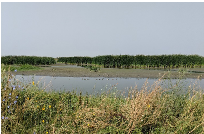
The Yolo Bypass Wildlife Area provides habitat for wildlife and recreation for people.