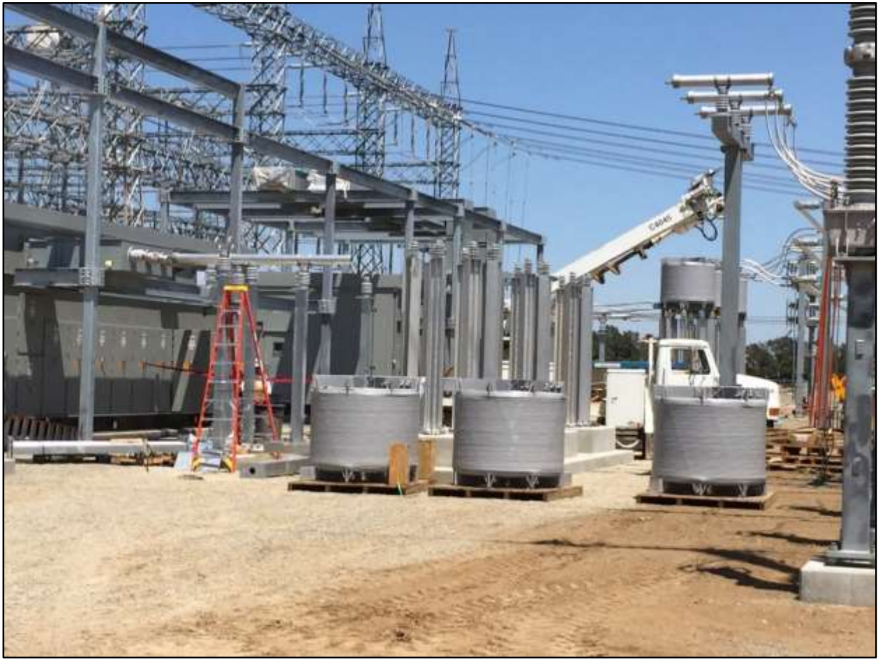
Tracy 13.8kV Switchgear/Breaker Replacement, Tracy Pumping Plant and Substation Building 8A being installed along with reactor columns, bushing box and 6-inch tubular bus