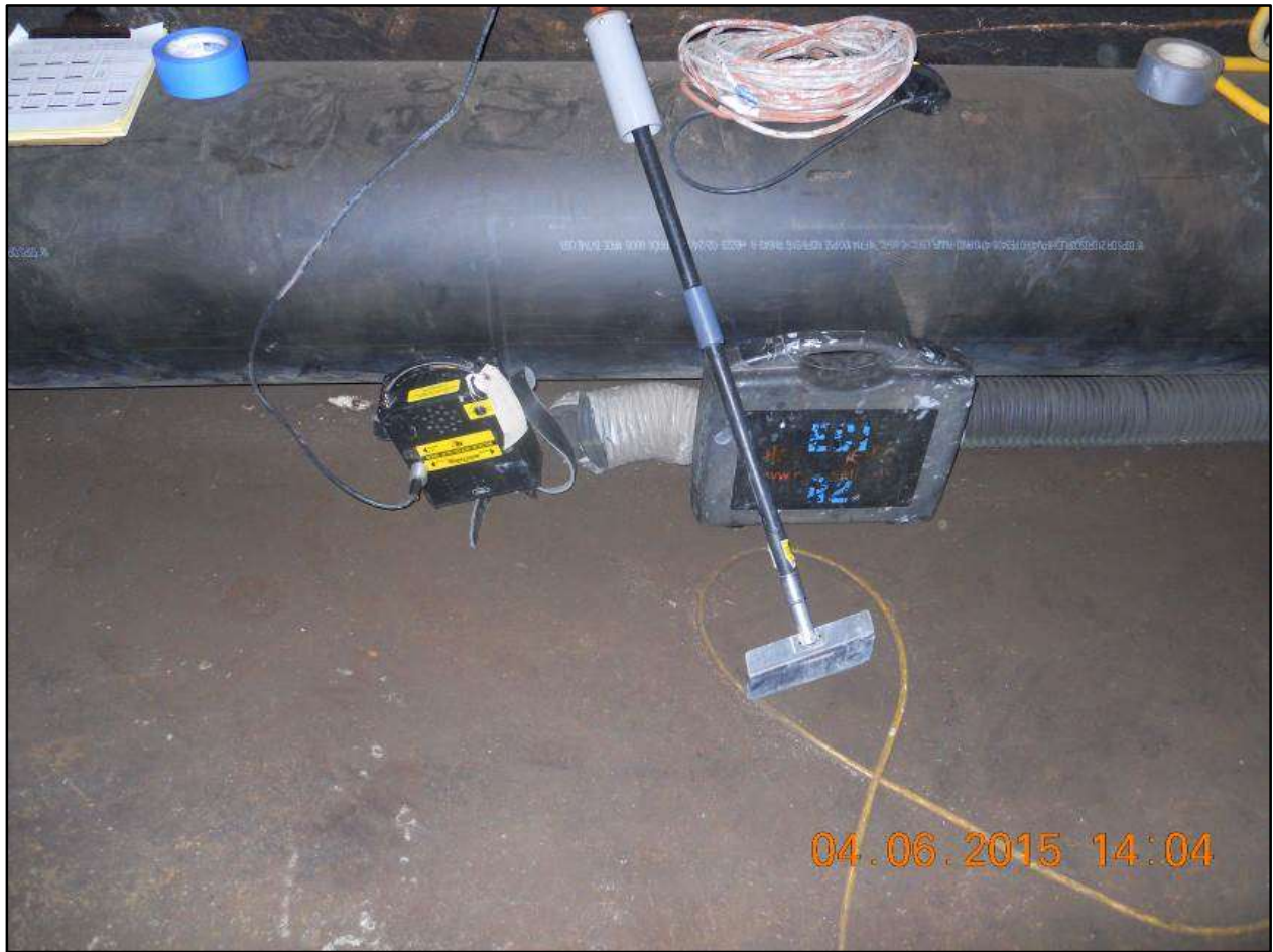
Prosser Creek Dam Refurbish High-Pressure Gate Seats and Regulating Gates Tinker & Rasor Holiday Detector testing equipment used for coating discontinuity testing