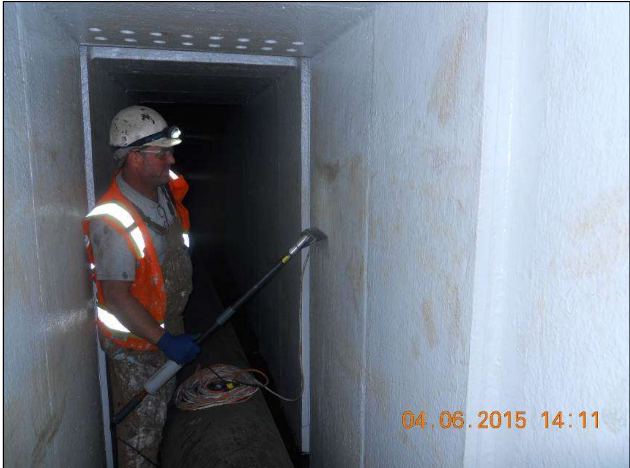
Prosser Creek Dam Refurbish High-Pressure Gate Seats and Regulating Gates ECI's general manager passes the holiday detector over the coating on gate frames 3 and 4.

All gates and gate frame materials as well as cylinders were shipped from the site to the contractor's shop for offsite fabrication work.