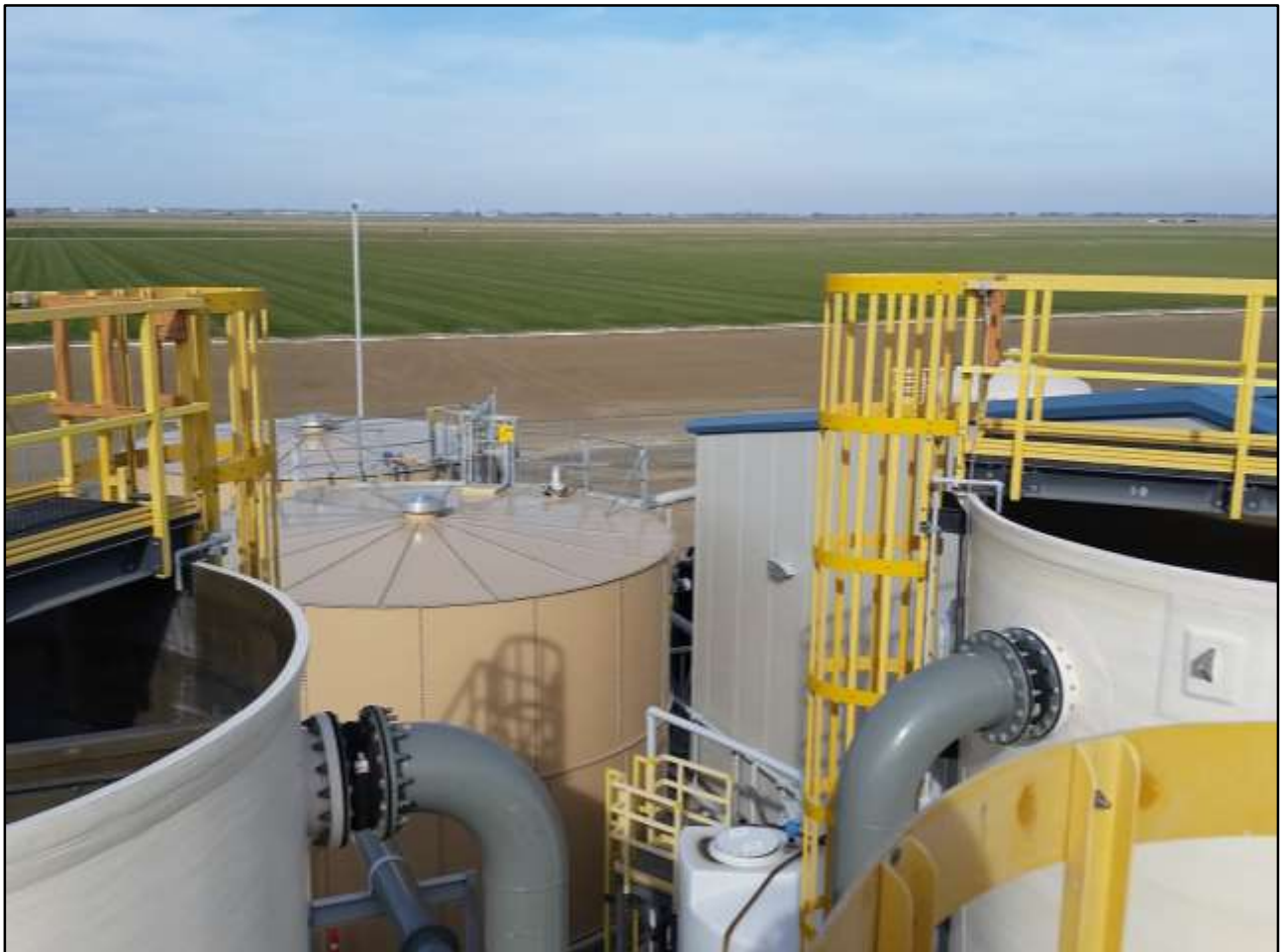
San Luis Demonstration Treatment Plant A view of the Advanced Biological Metals Bioreactor tanks during a tank backwash