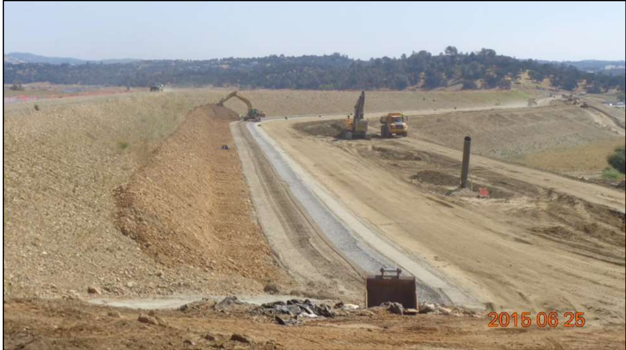
Mormon Island Auxiliary Dam Overlay Granite Construction benching the existing embankment to allow Construction of the vertical chimney section

Suulutaaq continued removing all the stormwater related piping and pumps at the site.