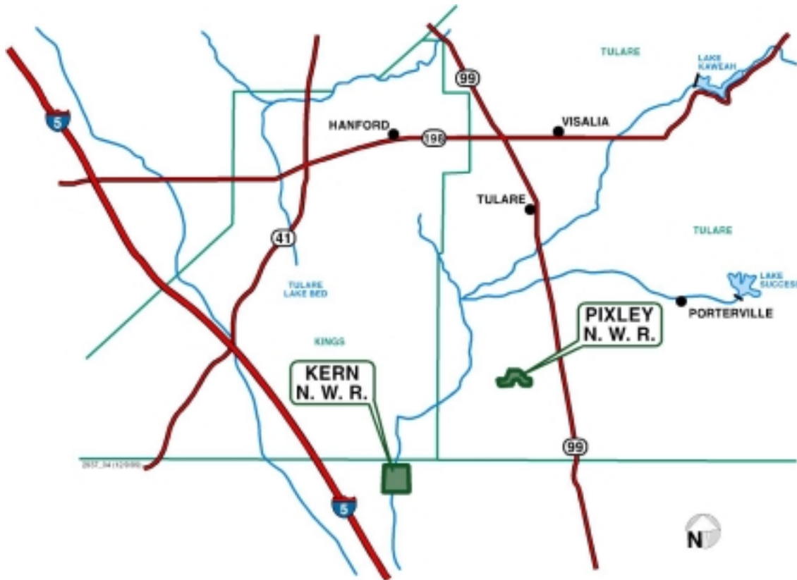
FIGURE 2-1 Tulare Lake Basin Refuges

The two NWRs evaluated in this EA are the Kern and Pixley NWRs, located in Kern and Tulare counties, respectively, in the Tulare Lake Basin. The two refuges are managed collectively by the Service as the Kern NWR Complex (Figure 2-1). The Tulare Lake Basin is primarily agricultural and rural. At one time the study area supported vast wetland habitats for migrating waterfowl. Although much of this land has been converted to agricultural use, small areas of wetland habitat remain.