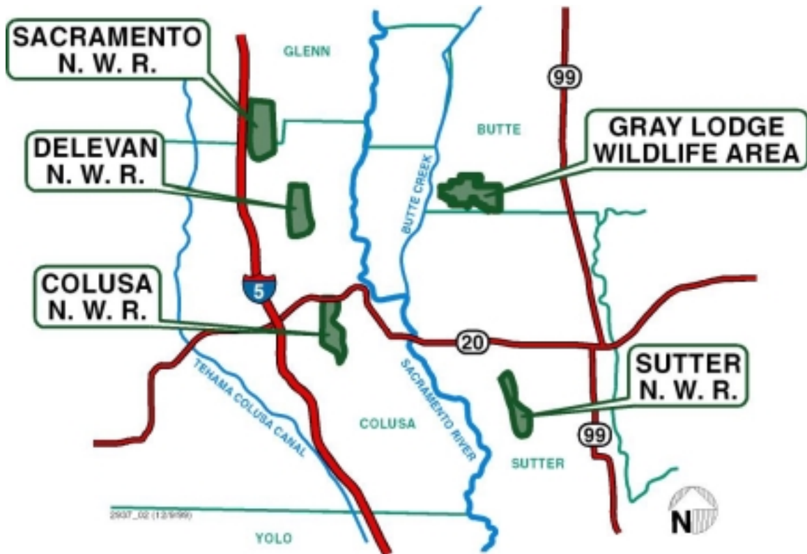
FIGURE 2-1 Sacramento River Basin Refuges

The four NWRs evaluated in this Environmental Assessment/Initial Study (EA/IS) lie in the Sacramento River Basin, in Glenn, Colusa, and Sutter counties. These NWRs are managed collectively by the Service as the Sacramento NWR Complex (Figure 2-1). Also within the Sacramento River Basin, the CDFG manages Gray Lodge WA in Sutter and Butte counties. Gray Lodge WA was also identified in the CVPIA.