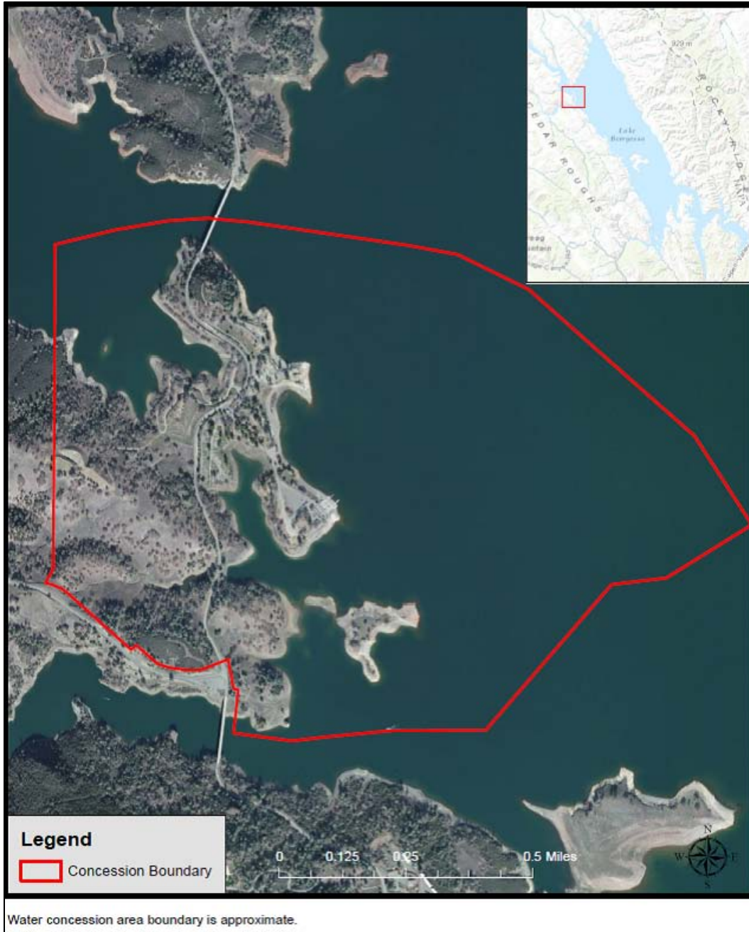
Figure 6.b - 5: Putah Canyon Recreation Area Boundary