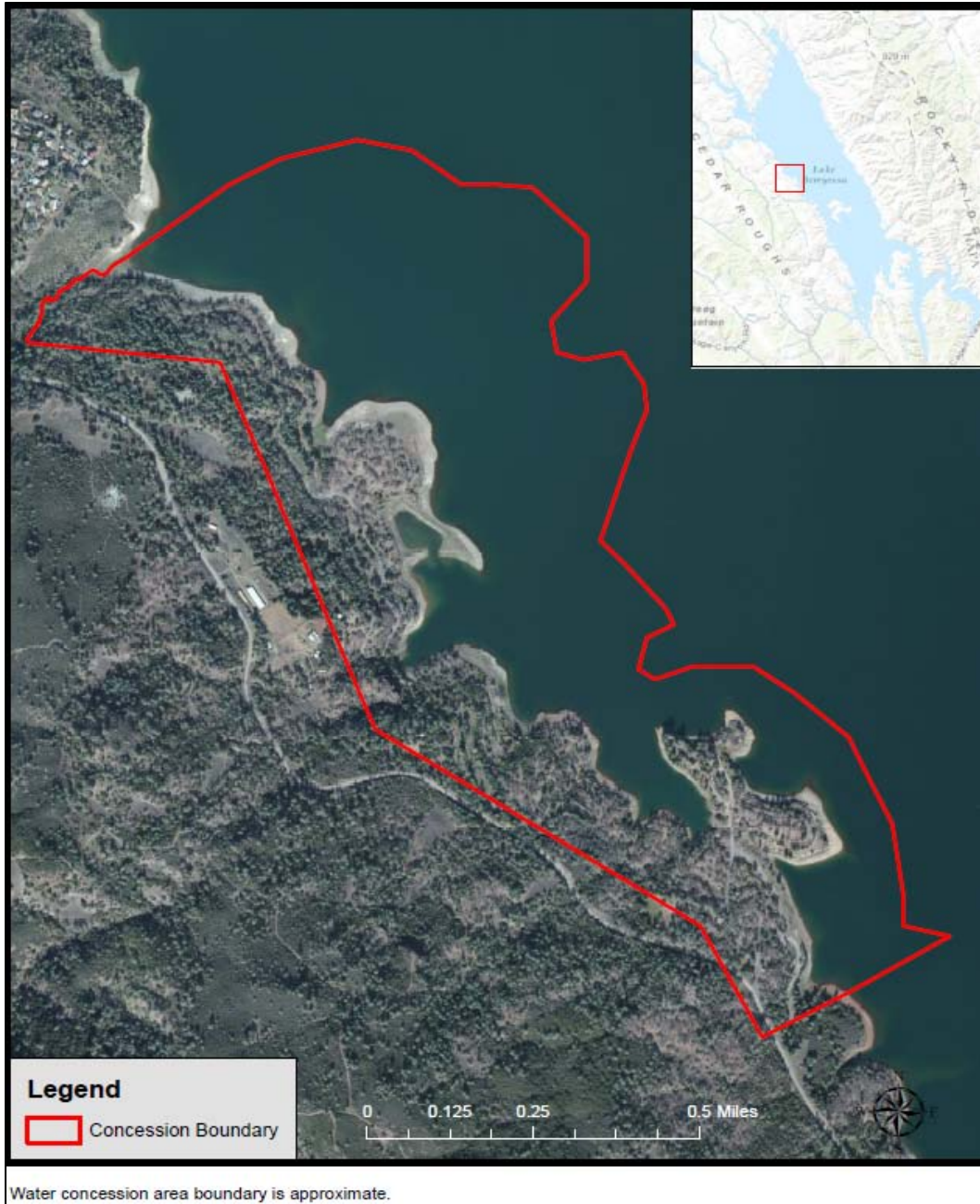
Figure 6.b - 2: Monticello Shores recreation Area Boundary