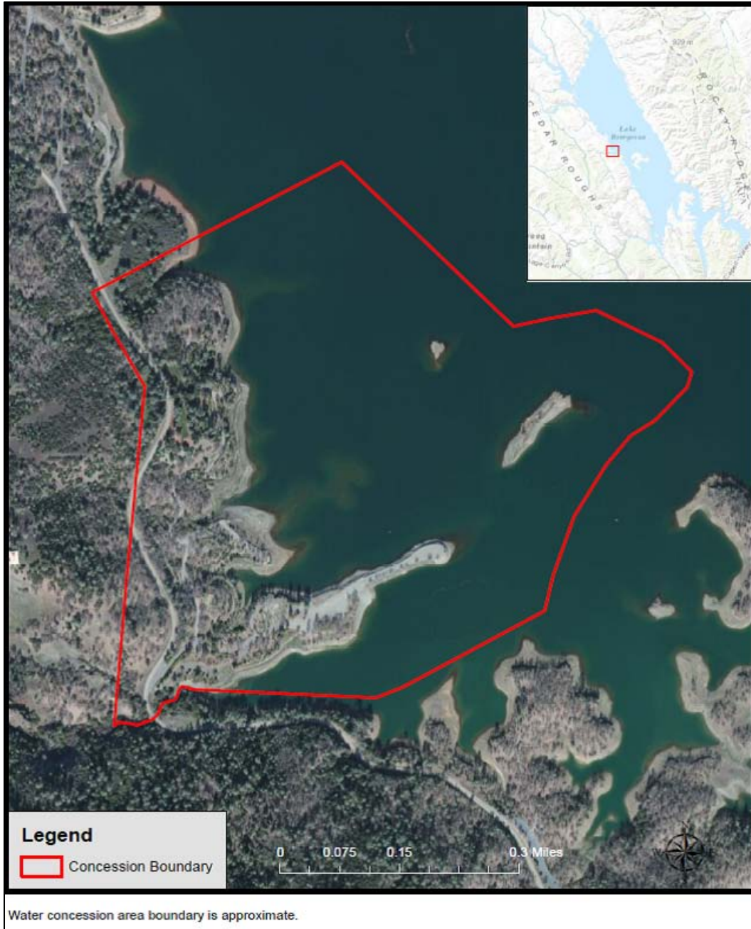
Figure 6.b - 3: Berryessa Point Recreation Area Boundary