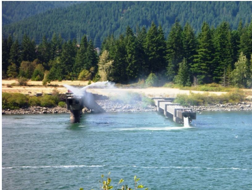
Figure 8.—Fish release of salmonid smolts at the Corps of Engineer Bonneville Dam Second powerhouse bypass outfall.

At each facility except Lower Granite Dam, larger salmonid smolts ( e.g. , steelhead [ O. mykiss ]) and debris are separated from smaller fish using horizontal bar racks or graders into separate barge holds to reduce stress (Congleton et al. 2000) and increase survival (Sanford et al. 2012) from mixing fish sizes and species. Debris levels are low and most debris is removed. The barges use a pump system to circulate river water through the holding tanks to both maintain adequate water quality and to offer local water for imprinting. Tow boats are used to move the barges through the river and may take from 79–96 h to reach the general release area. Barge riders accompany the fish transport to monitor barging operations and water quality (temperature and dissolved oxygen levels). Schedules are arranged so that barged fish are released at a randomly selected location about 4.8–8.0 km (3–5 mi) downstream of Bonneville Dam at night to minimize predation. The fish are released by gravity when plungers over the release orifices are raised. Truck transported fish are released through the Bonneville Dam Second Powerhouse juvenile salmon bypass outfall with water cannons in use to deter avian predators (Nelson Big gun sprinkler mounted on the end of the outfall pipe; Figure 8). Prior to that modification, trucked fish were driven to a boat ramp below Bonneville Dam where the truck was loaded onto a barge and moved to the center of the river for fish release.