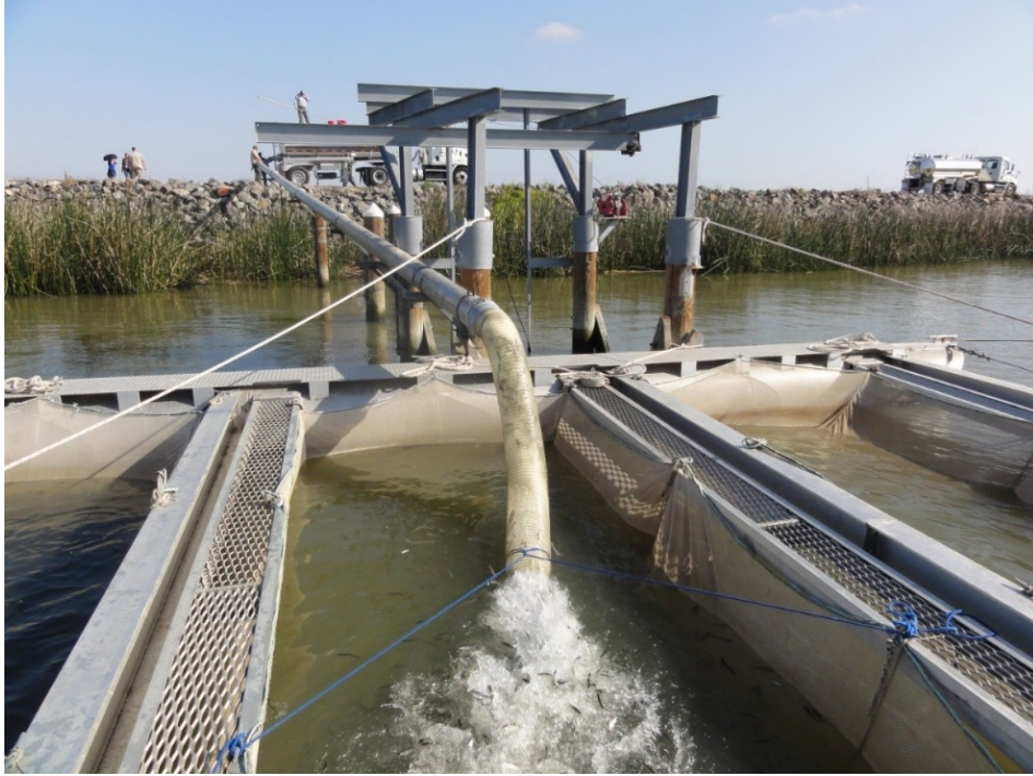
Figure 6.—Net pen structure used to receive, acclimate, and release hatchery fish.

Net pen releases are being used in the Delta at Eddo's Harbor on Sherman Island and other sites. Pens are moored at the Eddo's Marina facilities and towed downstream to the receiving area in the San Joaquin River. Here, fish are transferred from transport trucks to pens using a combination of rigid and flexible pipe (see Figure 6). After receiving the fish, the pens are slowly moved downstream on the north side of the channel toward the Antioch Bridge and released after 1 – 4 h of acclimation on the ebb tide (Figure 7). During this time, the Fishery Foundation crew angles for striped bass to assess the predator density, and delays fish release until they reach an area of relatively few striped bass captures.