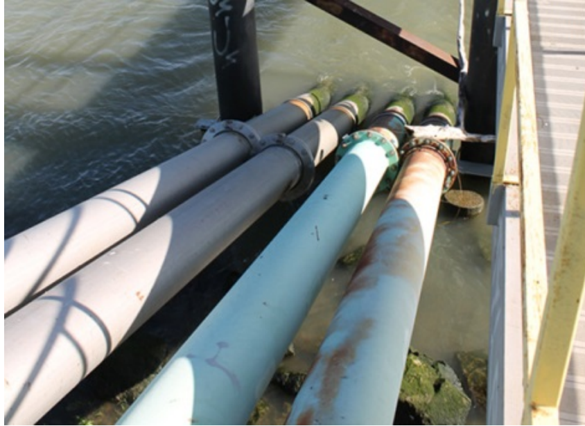
Figure 3.—Emmaton fish release site.