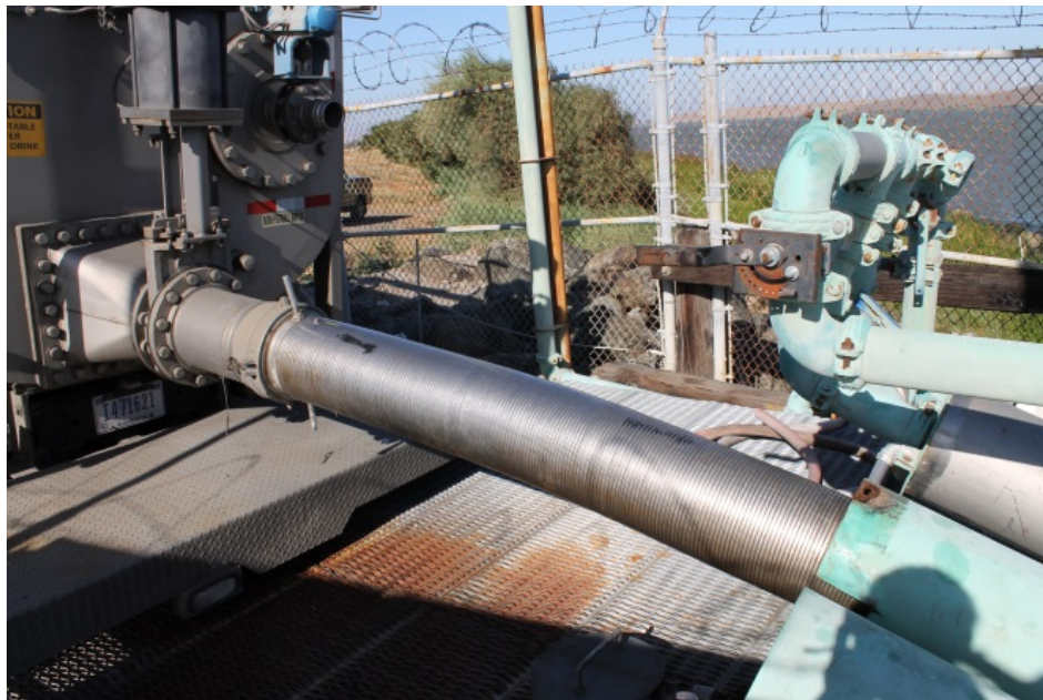
Figure 2.—Fish transport truck (upper left), old chute for surface release system (upper right), and current system of transport truck connected to site release pipe for underwater release (lower).

Water pumps (about 757 – 1,514 L/min, 200 – 400 gpm) are housed in separate pipes parallel to the fish release pipes, and provide water to rinse out the truck and release pipe. Pump intakes are screened with a perforated screen (6.4 mm [0.25 in] holes).