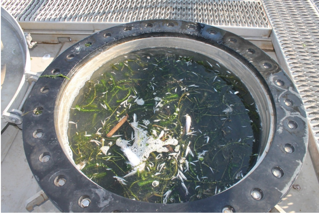
Figure 5.—Debris inside TFCF fish-transport truck.