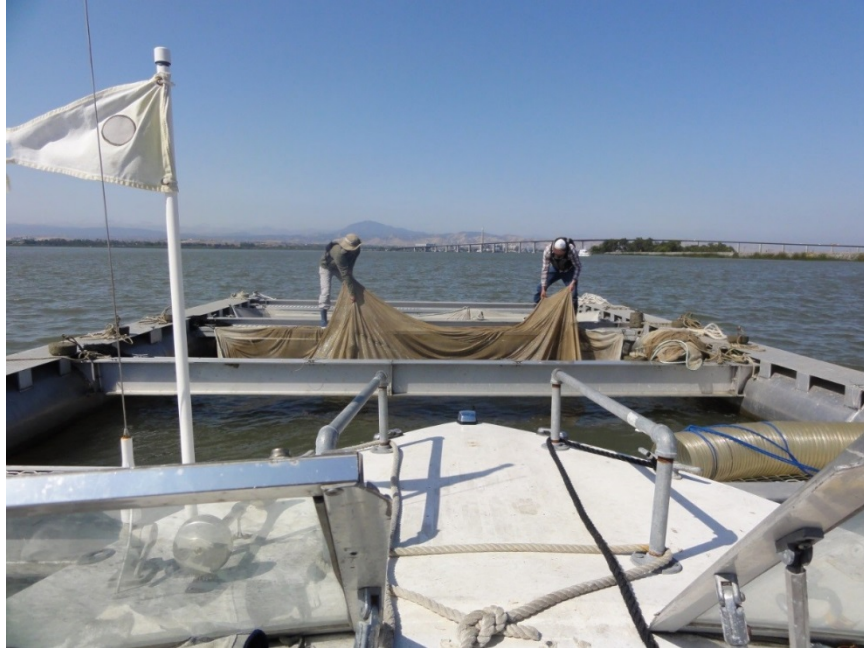
Figure 7.—Releasing acclimated hatchery Chinook salmon smolts.

TFCF are acclimated to Delta water, are usually held with varying amounts of aquatic debris in mixed size and species assemblages, and the relatively small numbers would probably make the net pen releases cost prohibitive.