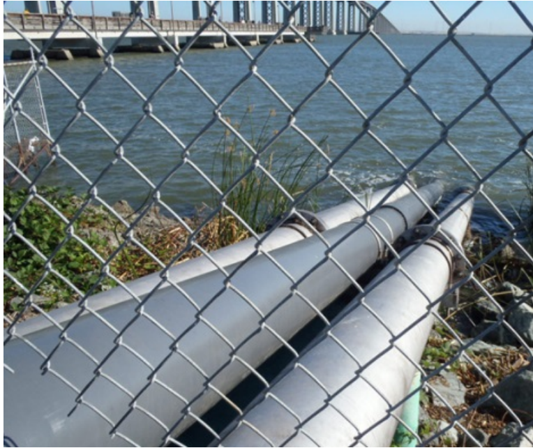
Figure 4.—Antioch fish release site.

The Antioch Bridge site is used at night because it is located within the city of Antioch and considered safer by the operators. Fish collected in the daytime at the TFCF are released at night at this location around 2000–2100 h. This site is scheduled for replacement in the near future as funds become available (J. Dealy, 2016, personal communication).