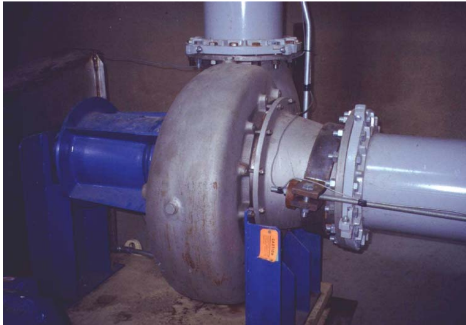
FIGURE 1.—Wemco-Hidrostral centrifugal pump used for the fish passage experiments.

7.3 to 8.2, T from 8.8 to 24.1 °C, EC from 0.09 to 0.65 mS/cm, and salinity from 0.01 to 0.33 parts per thousand. All herbaceous and woody debris naturally entrained in the pump were weighed (wet weight) for each trial.