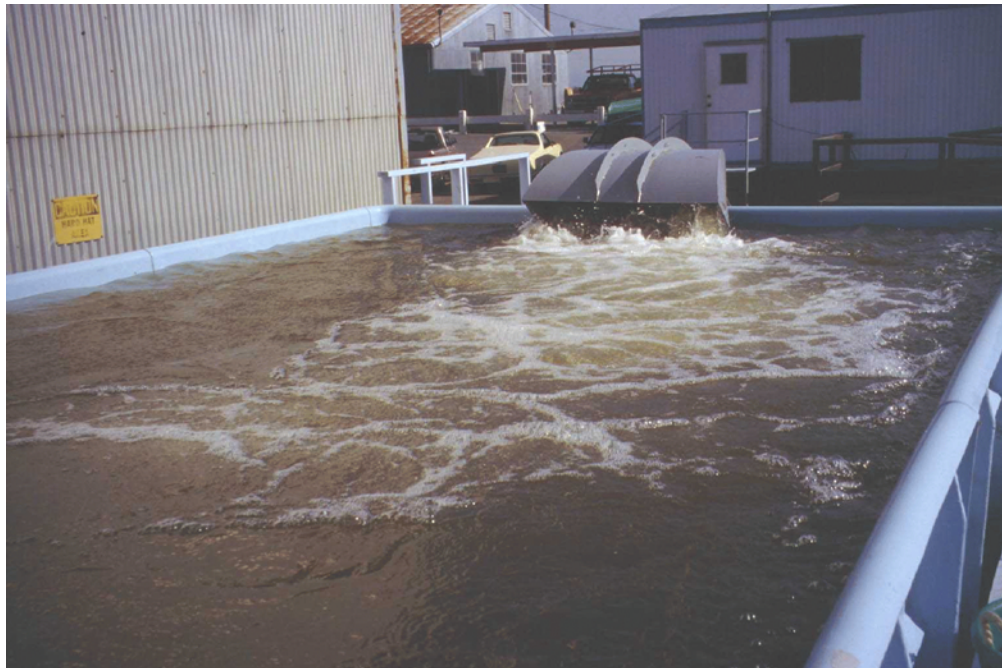
FIGURE 3.—Collection pool where fish were collected by handnet.

average velocity of 3.67 cm/s in order to reduce the potential for fish impingement on the rotating debris screen at the pool discharge. Fish were collected by handnet in the pool sump, (4.4 x 0.6 x 0.3 m deep) after excess water was gradually drained through a rotating drum screen (perforated plate, 0.24-cm mesh). The rotating drum screen was mounted at the downstream end of the holding pool to prevent escape of fish and to remove debris. A stationary perforated plate (0.24-cm mesh) was placed diagonally in front of the sump drain to prevent escape of fish and to collect and remove debris for analysis.