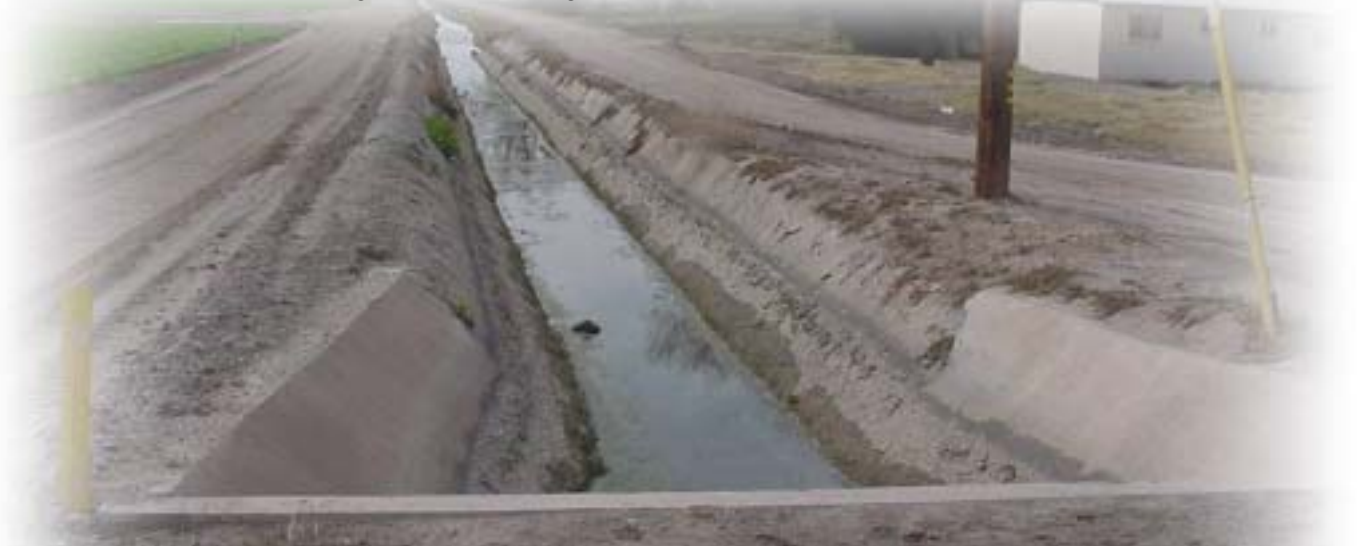
Bard – Ranch 5