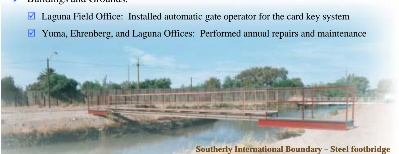
Southerly International Boundary - Steel footbridge