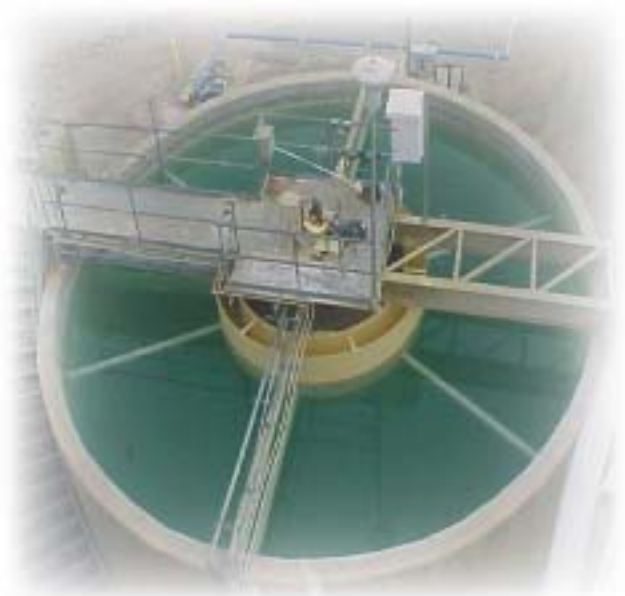
WQIC Research Project - Solids Contact Reactor