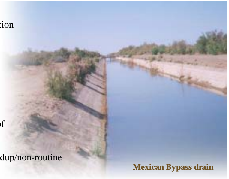
Mexican Bypass drain