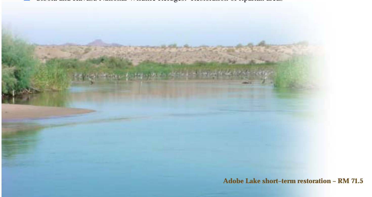
Adobe Lake short-term restoration – RM 71.5