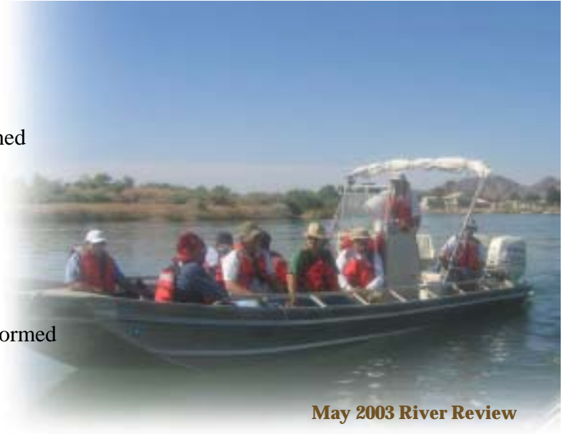
May 2003 River Review