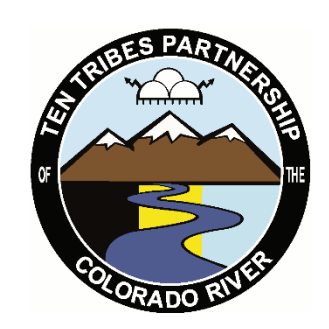
Ten Tribes Partnership