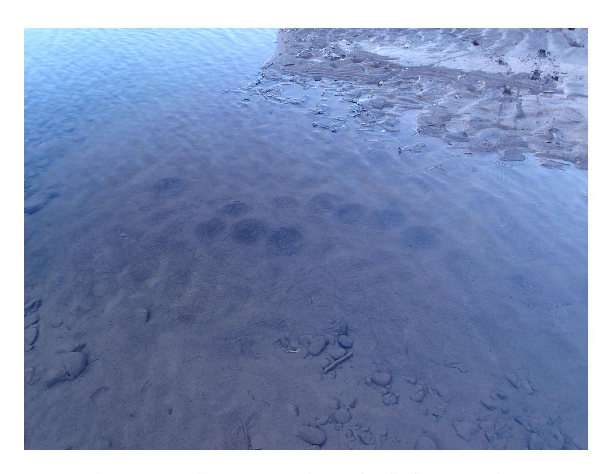
Figure 4. Blue River, Greenlee Co., Arizona, showing longfin dace Agosia chrysogaster spawning depressions or "nests" in soft, sandy substrate near the constructed fish barrier. taken October 29, 2014.