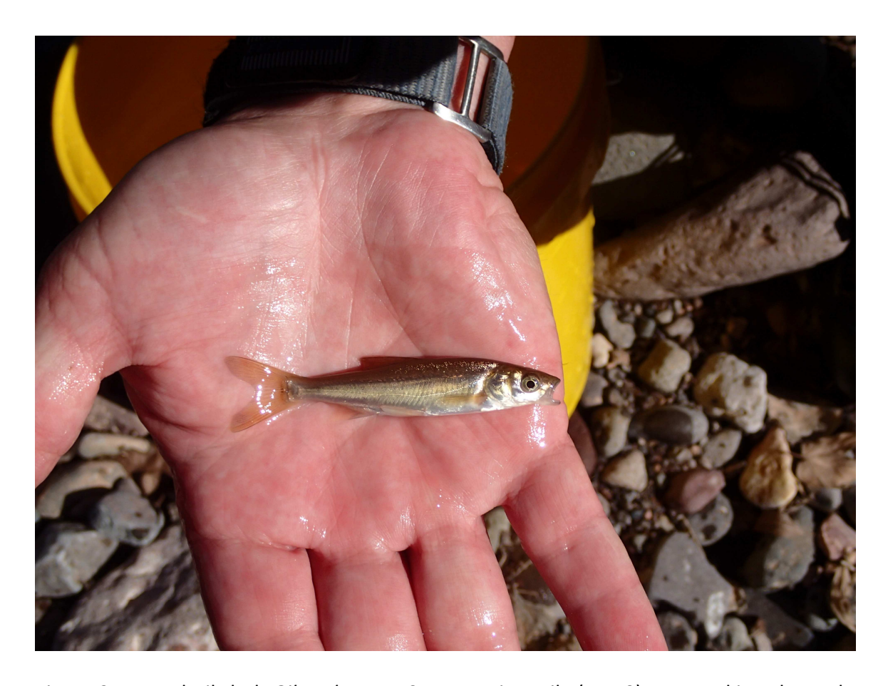
Figure 3. Roundtail chub Gila robusta ; 70-mm TL, juvenile (age-0) captured in sub-reach 3, 400 m upstream of the constructed fish barrier, Blue River, Greenlee Co., Arizona. taken October 29, 2014.