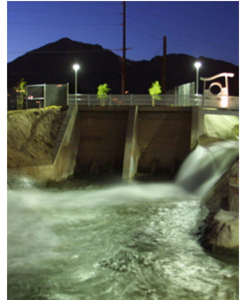
Waterworks at Arizona Falls (Reclamation).