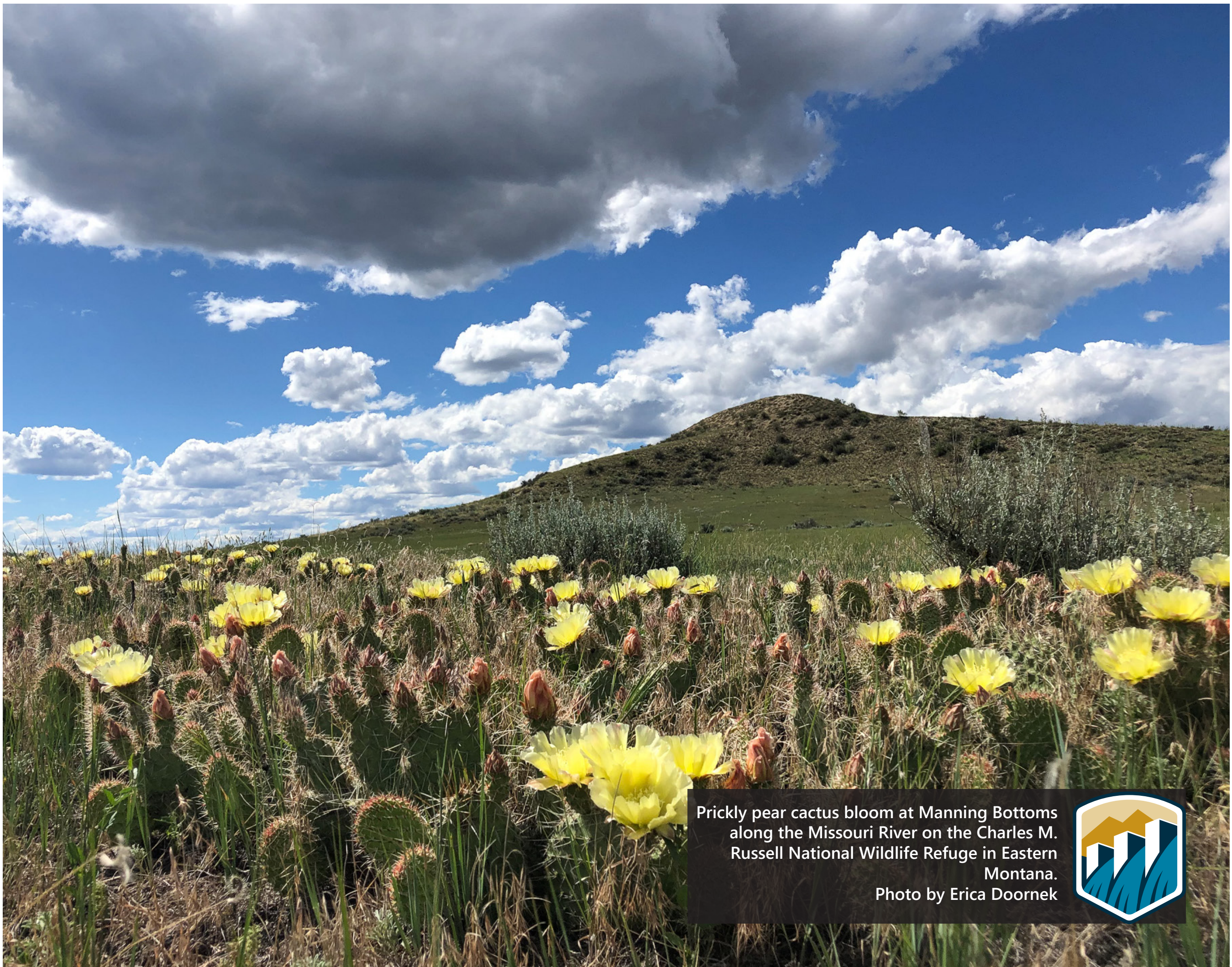
Prickly pear cactus bloom at Manning Bottoms along the Missouri River on the Charles M. Russell National Wildlife Refuge in Eastern Montana.