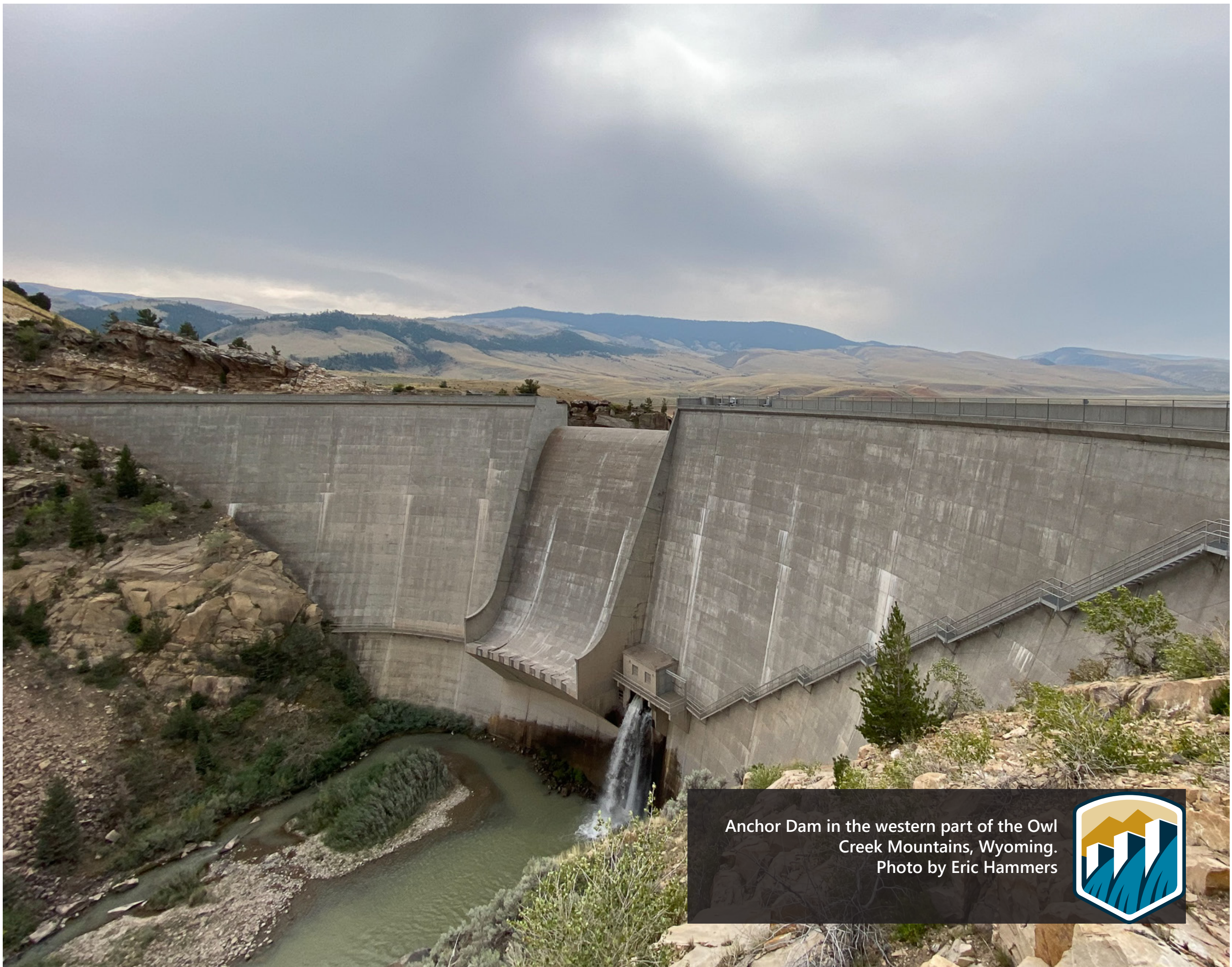
Anchor Dam in the western part of the Owl Creek Mountains, Wyoming.