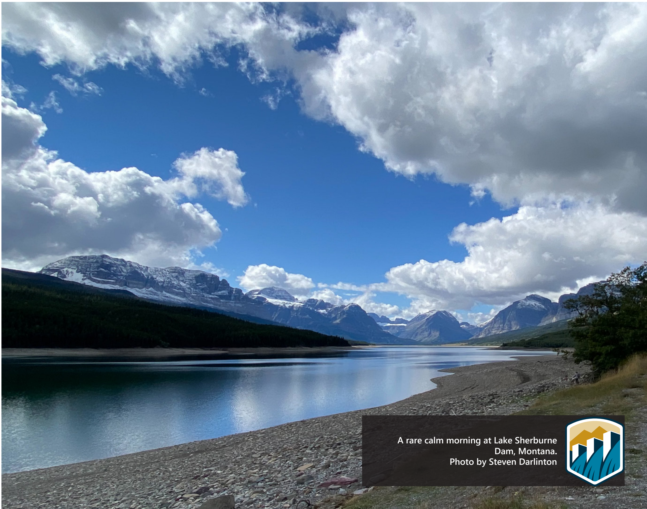
A rare calm morning at Lake Sherburne Dam, Montana.