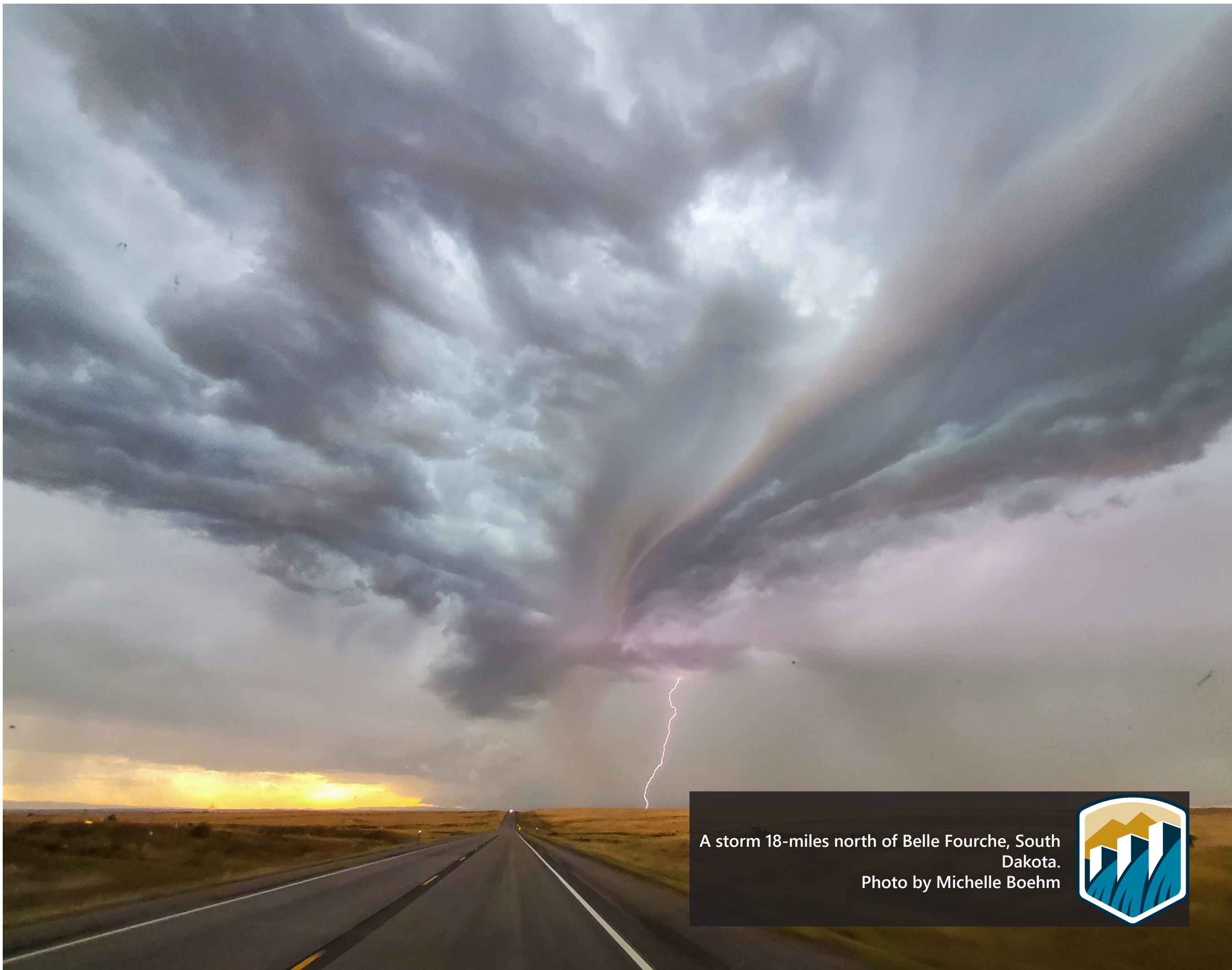
A storm 18-miles north of Belle Fourche, South Dakota.