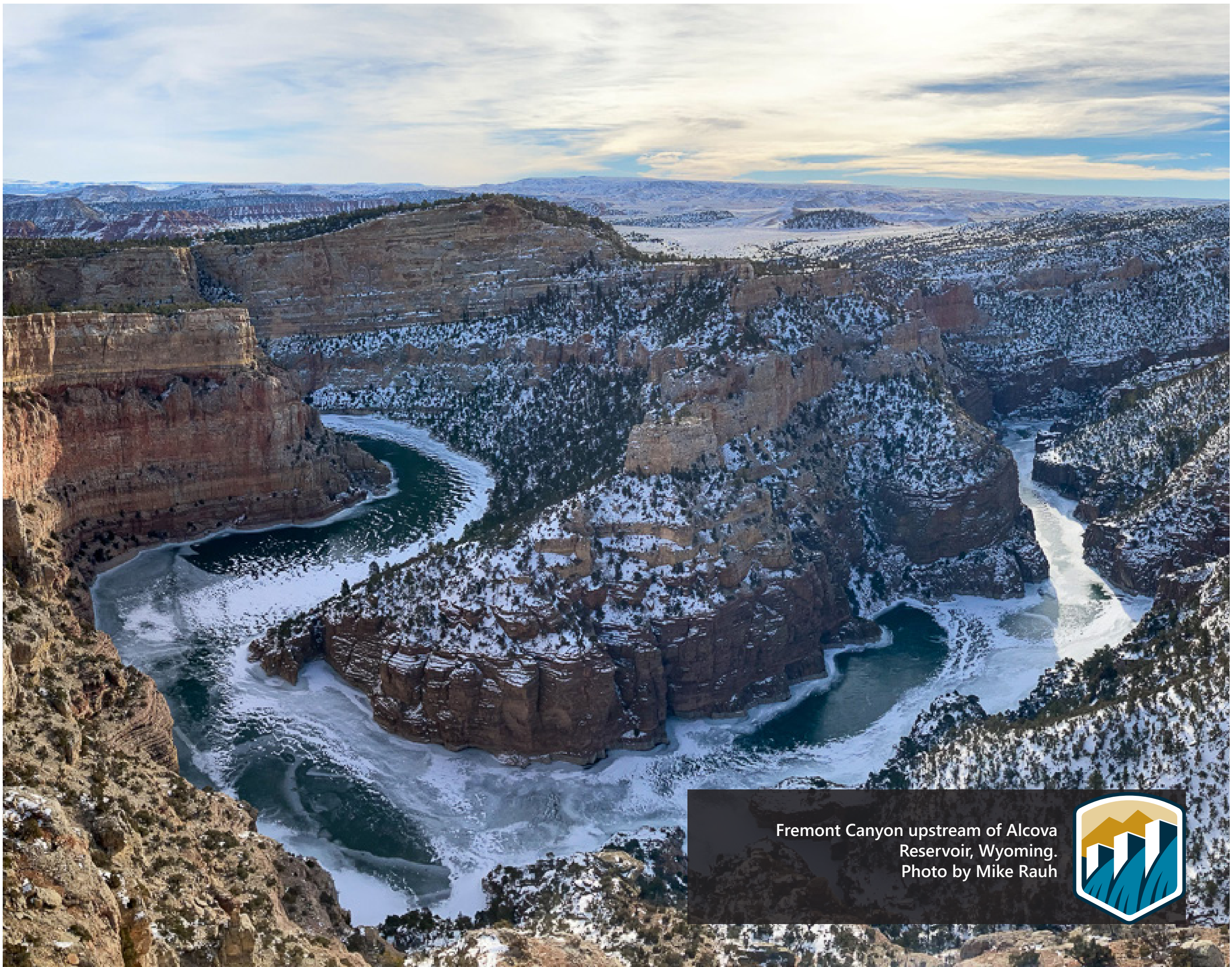
Fremont Canyon upstream of Alcova Reservoir, Wyoming.