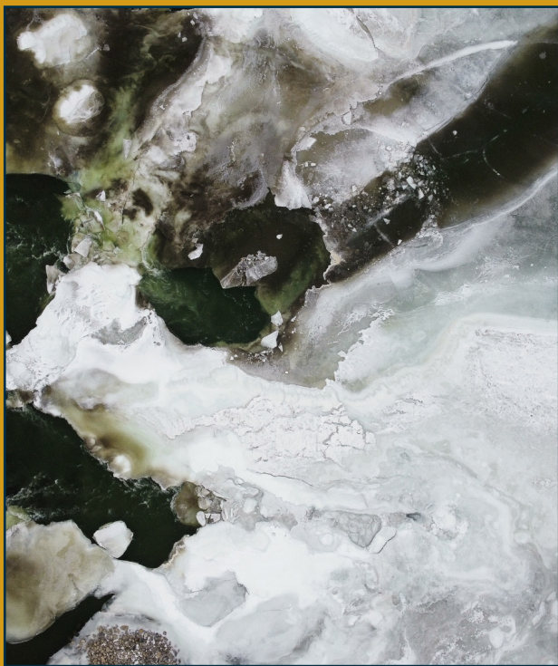
Ice on the Yellowstone River near the Huntley Project Intake diversion, Montana.