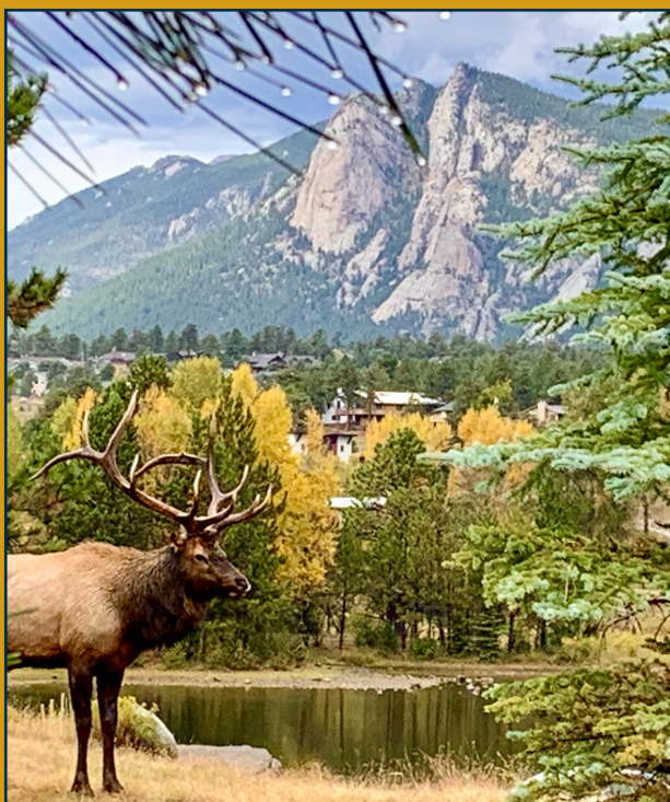
A Bull elk standing in front of Lake Estes, just behind the Lake Estes Powerplant, located in Estes Park, Colorado.