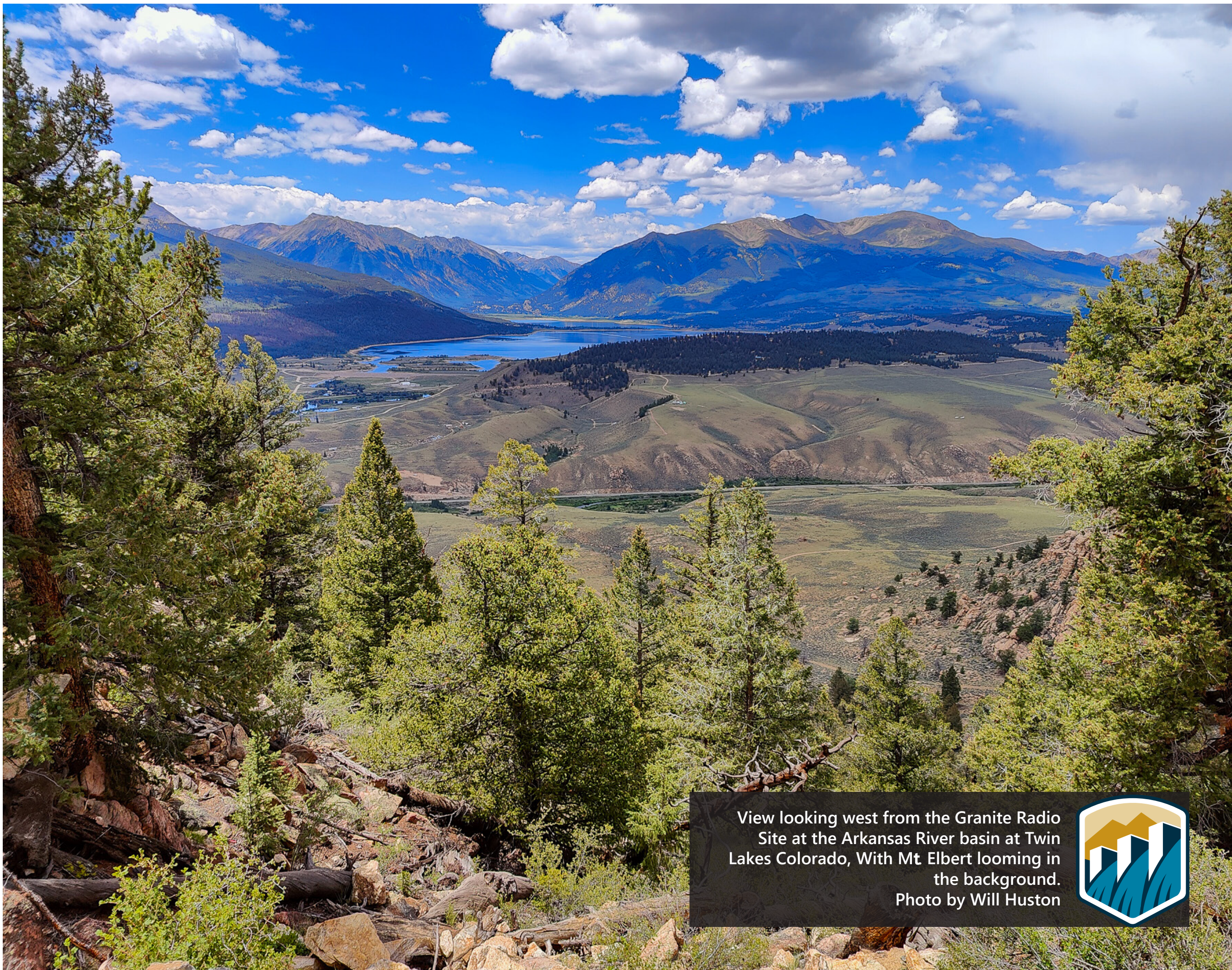
View looking west from the Granite Radio Site at the Arkansas River basin at Twin Lakes Colorado, With Mt Elbert looming in the background.