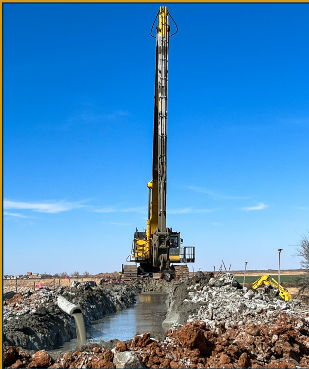
Altus Dike construction project, Oklahoma.