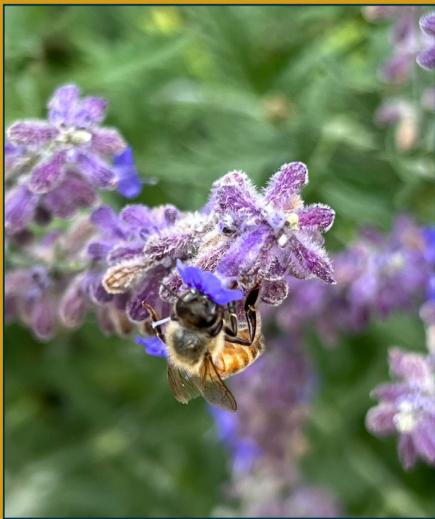
A bee scoring some killer sage nectar at Keyhole, Wyoming.