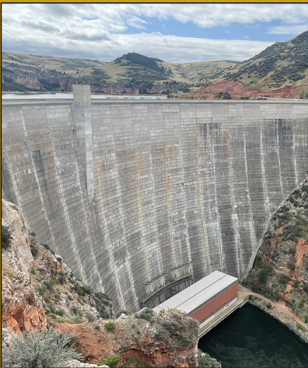
A cooler fall afternoon at Yellowtail Dam, Montana.