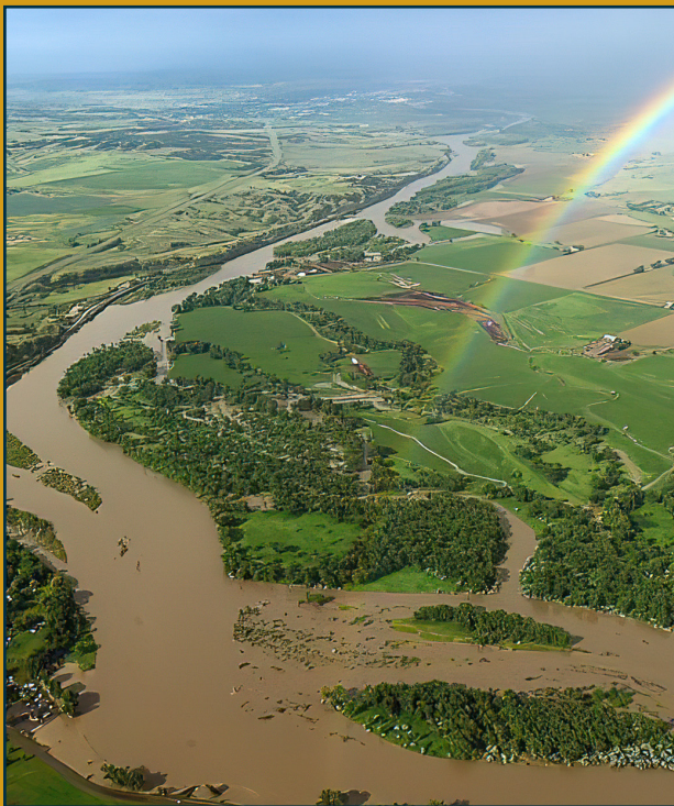
High flows on the Yellowstone River near Huntley, Montana.