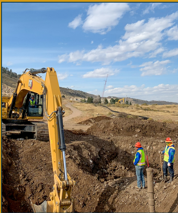
Garney Construction excavating a trench immediately downstream of Soldier Canyon Dam, Colorado.