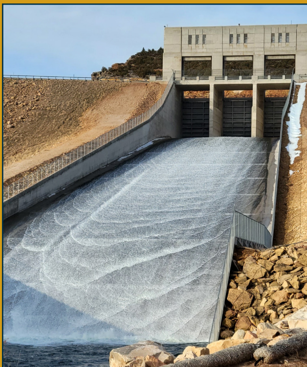
Just a little bit of water at the Kendrick Project, Wyoming.