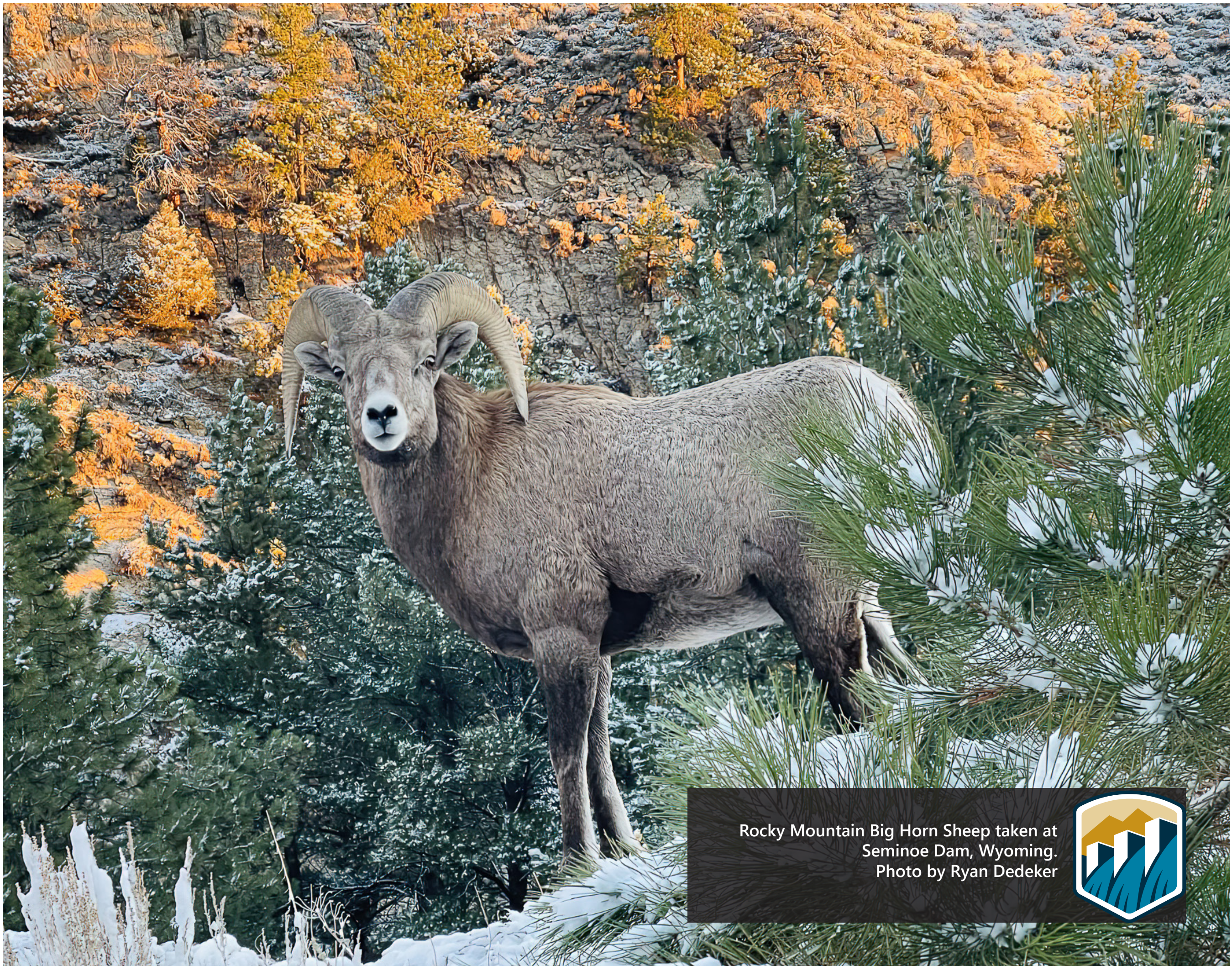
Rocky Mountain Big Horn Sheep taken at Seminoe Dam, Wyoming.