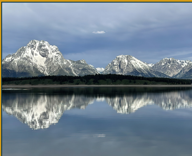
The Minidoka Project 1385 at Teton National Park, Idaho.