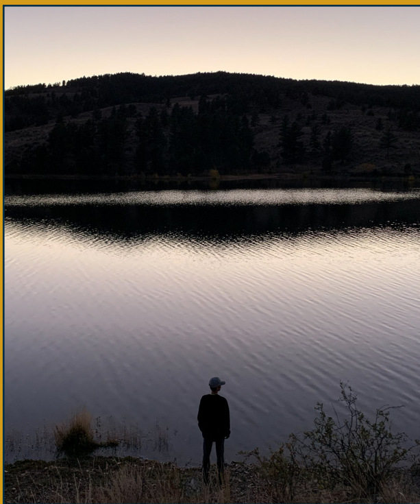
Dusk at Pinewood Reservoir, Colorado.