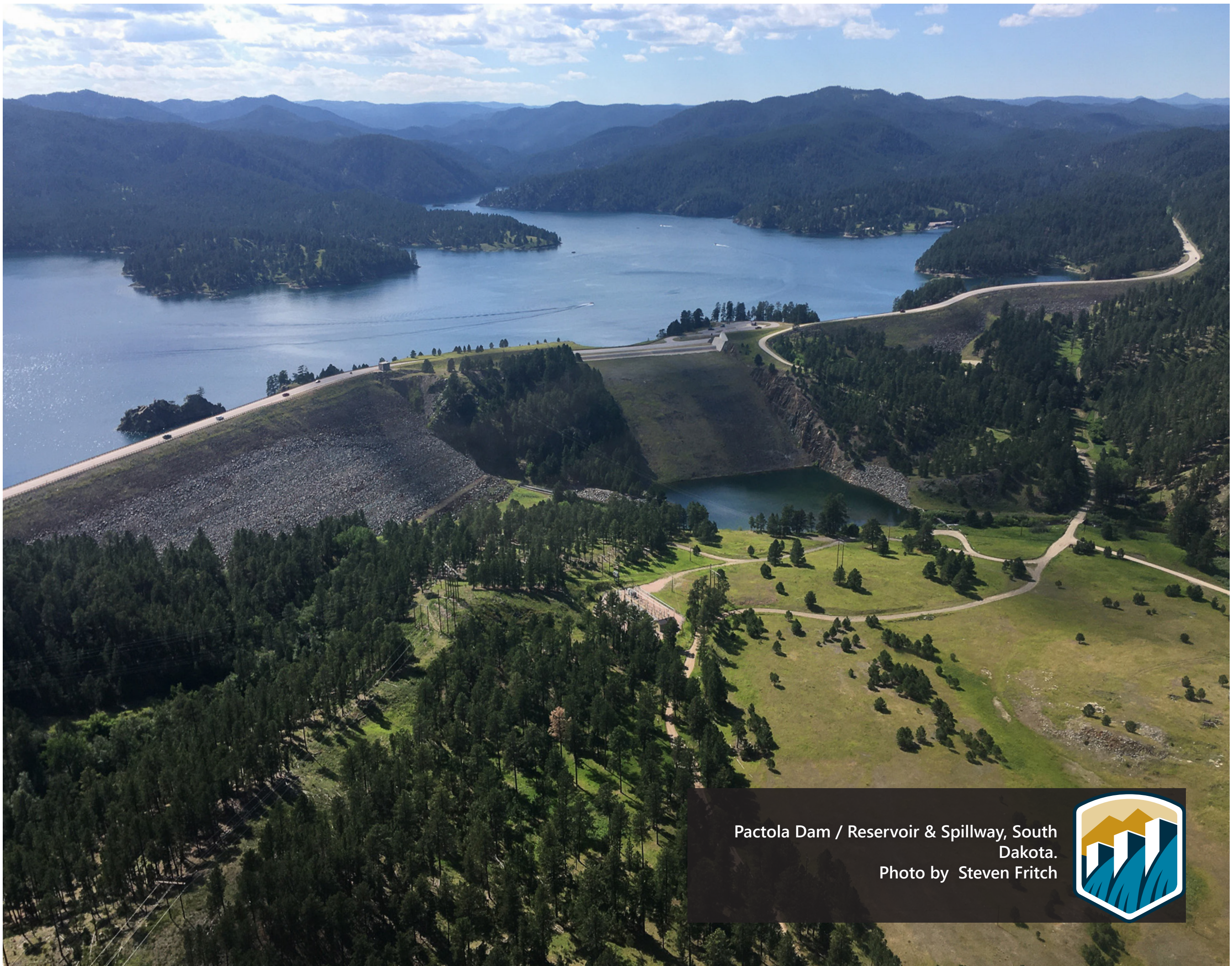
Pactola Dam / Reservoir & Spillway, South Dakota.