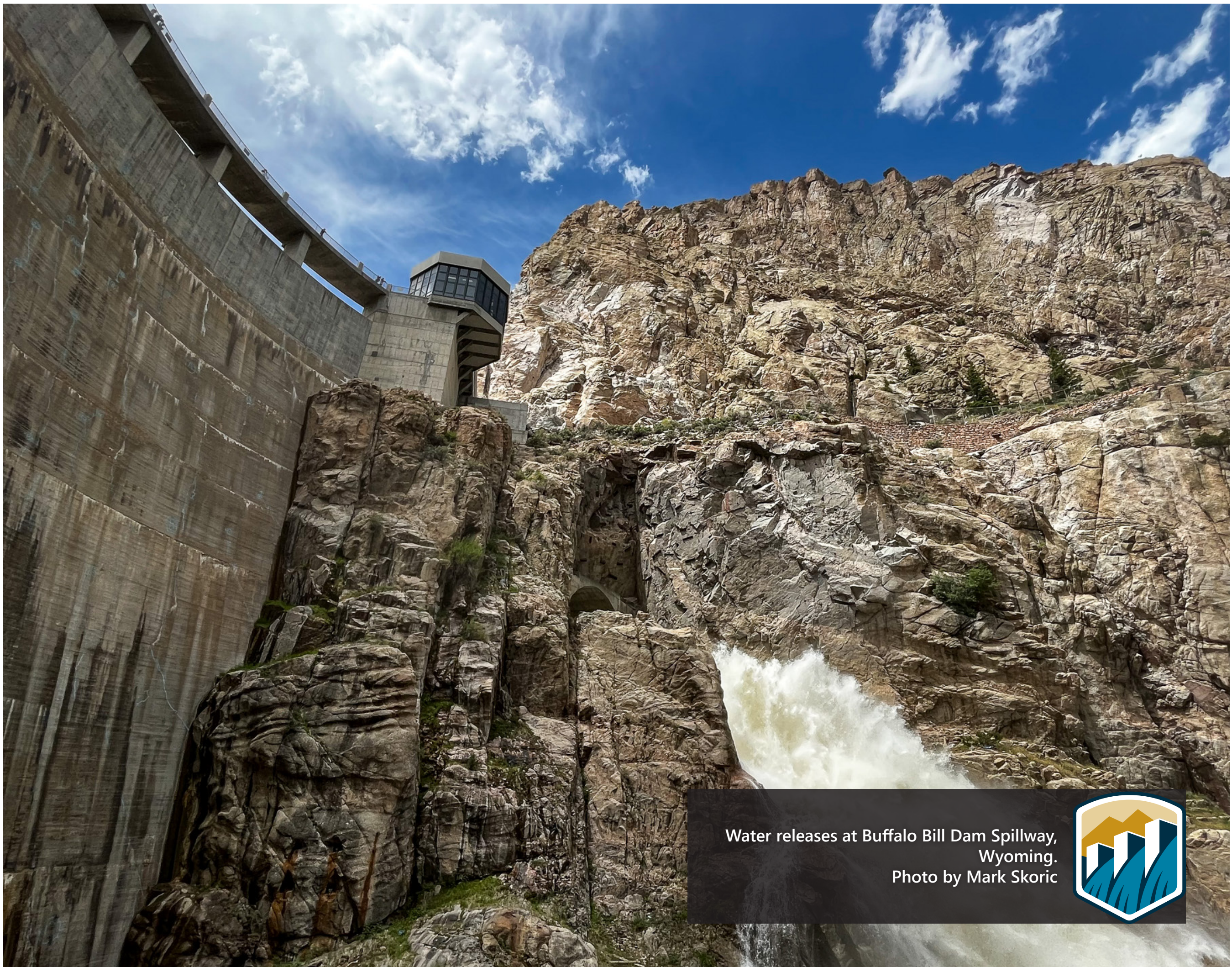
Water releases at Buffalo Bill Dam Spillway, Wyoming.