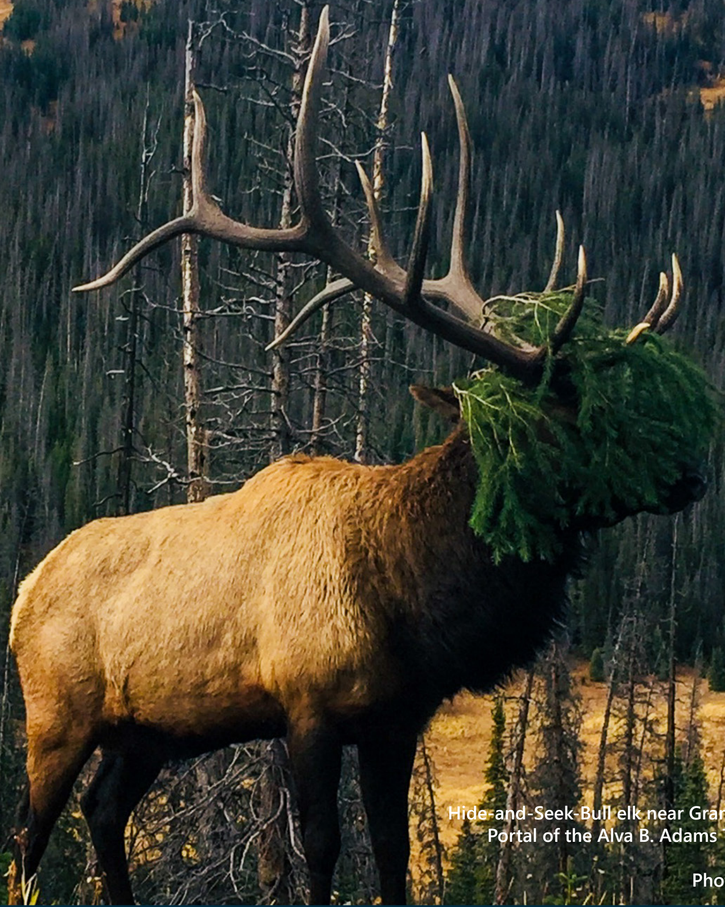
Hide-and-Seek-Bull elk near Grand Lake and the West Portal of the Alva B. Adams Tunnel, Colorado-Big Thompson Project.

Bureau of Reclamation, Missouri Basin Region