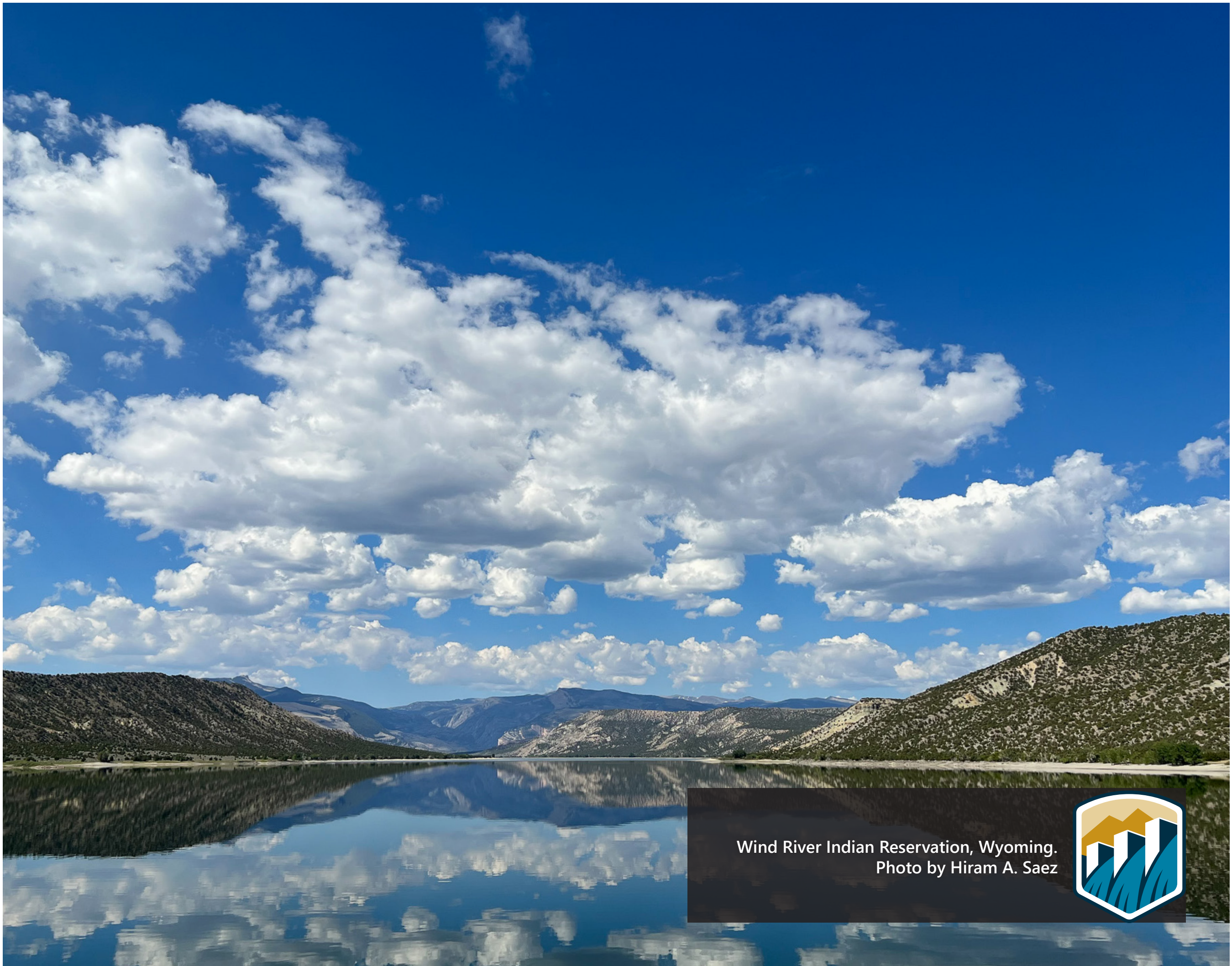
Wind River Indian Reservation, Wyoming. Photo by Hiram A. Saez