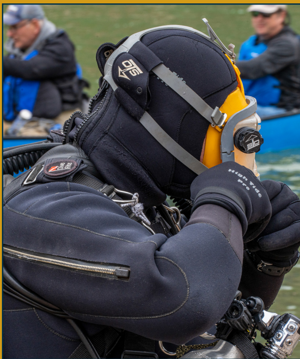
Divers from the Denver office perform dye testing at Guernsey Dam, Wyoming.