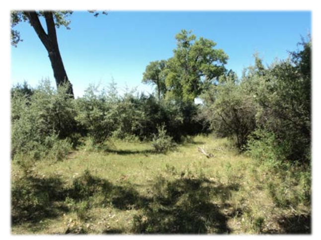
Photograph 19 – View of cottonwood gallery forests near S-9 facing north