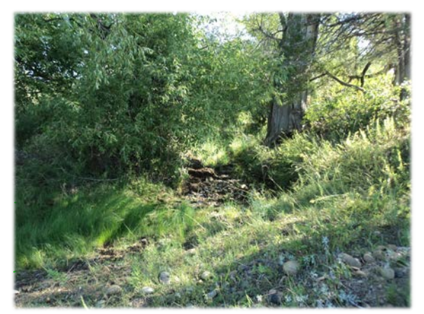
Photograph 3- View of S-1 and spring within lower end of DW-1 facing southwest

Emergent wetlands formed a band from two inches to six feet wide around the stream. The wetlands transition to uplands where the stream dissipates. Hydrophytic trees dominate the overstory above the stream and herbaceous wetlands. Approximately 0.12 acres of Palustrine Forested Temporarily to Seasonally Flooded (PFOA/C) wetlands were surveyed at this location and are shown in green in Figure 1. See Photographs 3, 4 and 5 for views of this area. Recorded vegetation species are listed in Table 2 below.