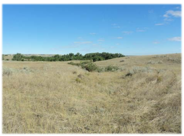
Photograph 7 – View from S-3 facing northwest showing DW-2