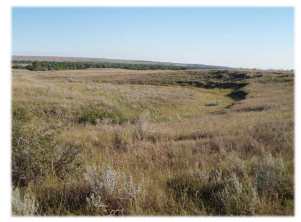
Photograph 10 - View where DW-3 transitions from grassed to forested drainageway facing north