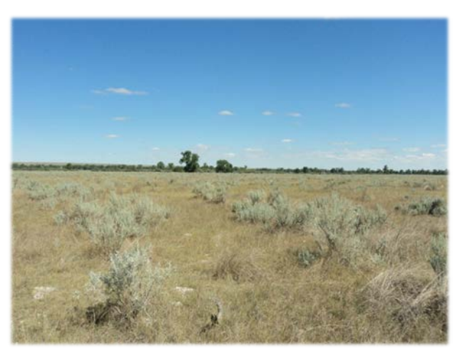
Photograph 21 - Typical view of sagebrush and crested wheatgrass community from PS-4 facing north

A majority of Joe's Island is dominated by a sagebrush and crested wheatgrass shrubland community. Multiple species of sagebrush and buffaloberry dominate the shrub stratum while crested wheatgrass and leafy spurge dominate the herbaceous understory. Old meander scars and areas that looked dark on aerials were investigated for wetlands or waterways. See Table 10 for species recorded at Sample point 10 (S-10) for typical vegetation in this