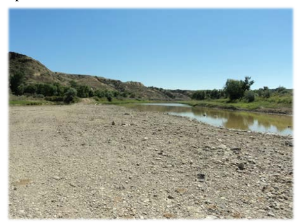
Photograph 17 - View of Backwater Area B from Photo Station 3 (PS-3) facing southeast

Backwater Area B – The NWI map classifies this area as Riverine Lower Perennial Unconsolidated Bottom Intermittently Exposed (R2UBG) channel backwater. See Figure 2 for backwater location. At the time of investigation there was very little vegetation within the area where an existing road would be improved to accommodate heavy machinery traffic. No vegetative species were recorded at Sample point 14 (S-14). Flow in the backwater was imperceptible and appeared to be stagnant. Sand and gravel were present adjacent to the open water areas. Backwater Area B connects directly to the Yellowstone River and contained approximately six acres of R2UBG habitat. See Photographs 17 and 18 below for depictions of this area.