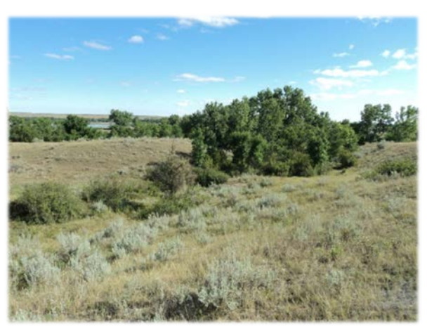
Photograph 8 – View near S-4 showing DW-2 facing northwest