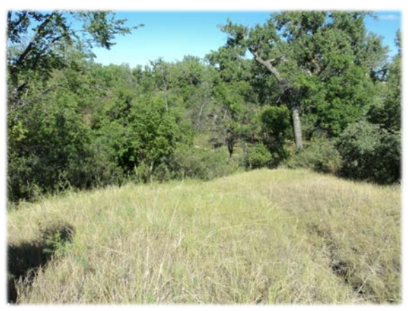
Photograph 13 - View from PS-2 facing north showing steep drop off outside investigation area