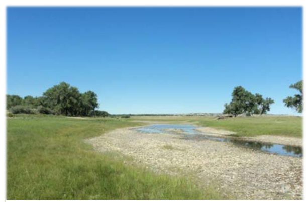
Photograph 15 - View from S-9 showing Backwater Area A facing west