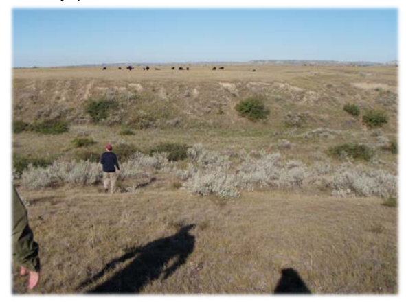
Photograph 1 – View from Photo Station 1 (PS-1) facing west showing upper end of DW- (south)