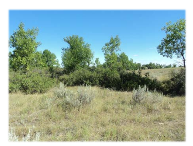
Photograph 12 - View showing S-7 facing northwest