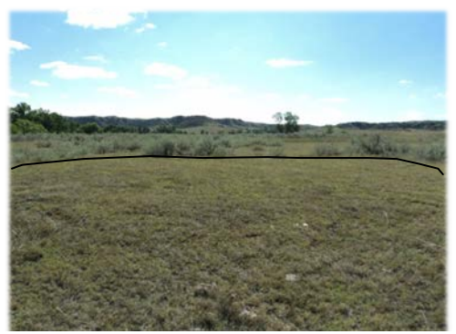
Photograph 9- View from S-5 of B-2 facing south

A slightly lower flat area was located west of DW-3 and appeared dark in a 2012 aerial photograph. Dark features on aerials may indicate wetness; therefore, a Sample point (S-5) was placed in the area to document observations. Conditions were very dry and only upland plants were identified. See Figure 1 for S-5 location and Table 5 for recorded vegetation. See Photograph 9 for a depiction of B-2 (foreground from black line).