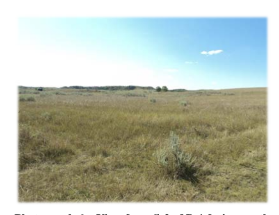
Photograph 6 – View from S-2 of B-1 facing north