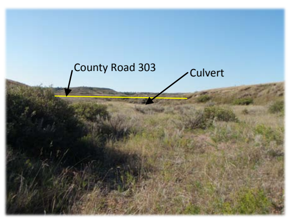
Photograph 2 – View from west of PS-1 from within DW-1 facing upstream

The lower end of DW-1 begins at the southern edge of a forested canopy where a seepage spring emerges from the hillside. See Photograph 3 for view of Sample point 1 (S-1), spring and wetlands (green line). The spring creates a narrow stream with gravel substrate that is approximately one- to four-inches deep and six-inches to five-feet wide. The stream flows in a northerly direction for approximately 325 feet until it dissipates and could no longer be observed. An OHWM was present near the current flow elevation.