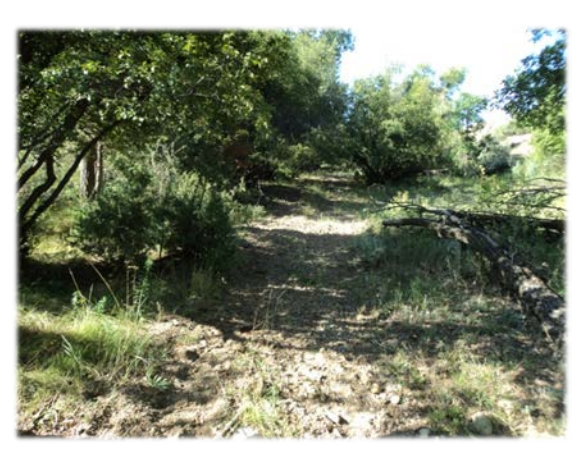
Photograph 5 – View of upland area where stream and wetlands end facing north