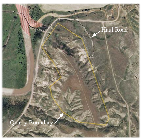
Figure 3. Quarry site

The desktop investigation indicated that this area likely did not contain wetlands or waterways. The quarry is on private land and permission was not obtained prior to the investigation, so investigators could not verify desktop findings in the field. Excavating material from here for construction on Joe's Island and the Waste Pile Site should not impact any waters of the U.S. at this site. No avoidance or minimization techniques are recommended regarding sensitive habitats for Area 3. See Figure 3 for an aerial view of this location.