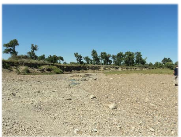
Photograph 18- View of Backwater Area B from PS-3 facing northwest