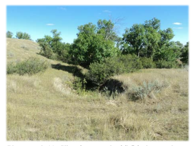
Photograph 11 - View from south of S-5 facing north showing DW-3 \,