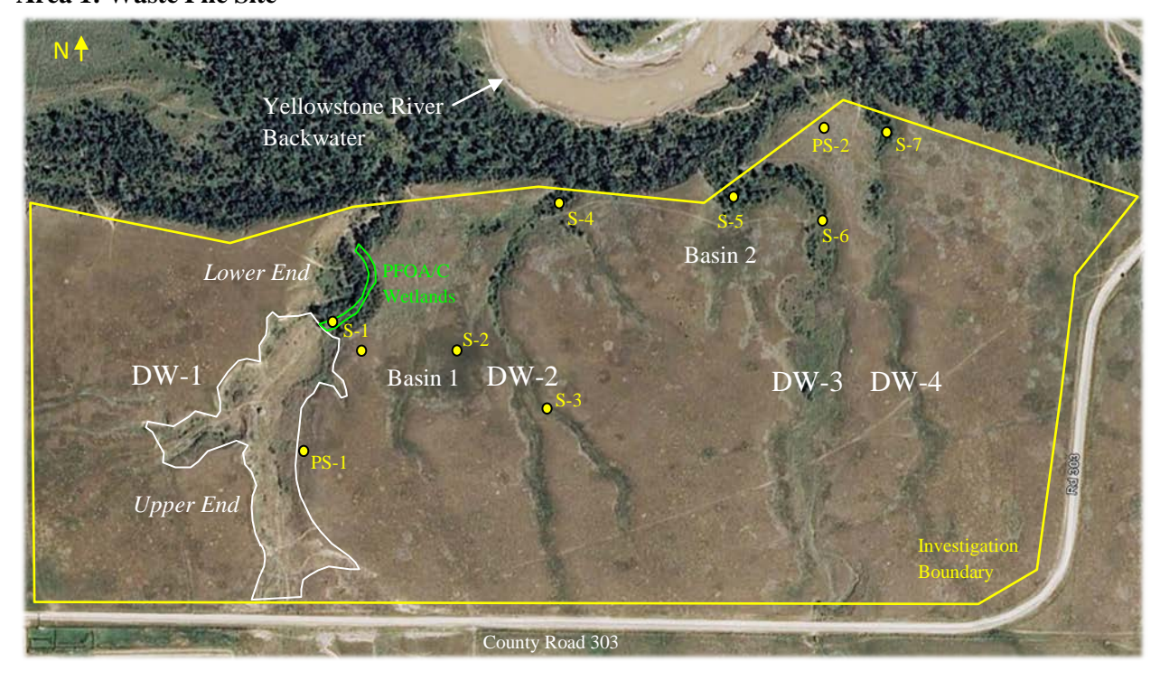
Figure 1. Waste pile site