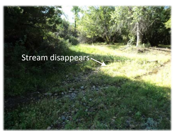
Photograph 4 – View of area where stream and wetlands transition to upland area facing southwest