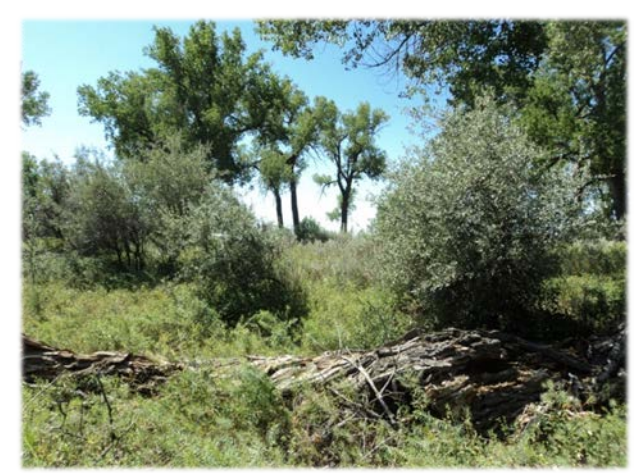
\begin{array}{l} Photograph \ 20-View \ of \ cottonwood \ gallery \ forests \ near \\ S-13 \ facing \ north \end{array}