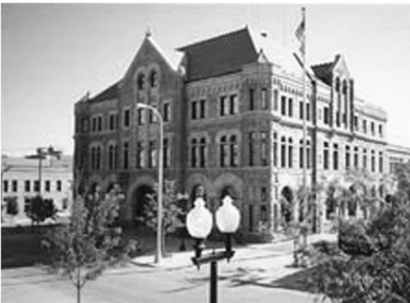
US District Courthouse, Sioux Falls, SD

From top left: Courthouse, Sioux Falls, South Dakota