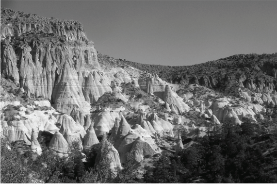
Tent Rocks, Jemez Mountains.