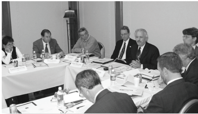
Southern Regional NEPA Roundtable discussion on the NEPA Task Force report Modernizing NEPA Implementation