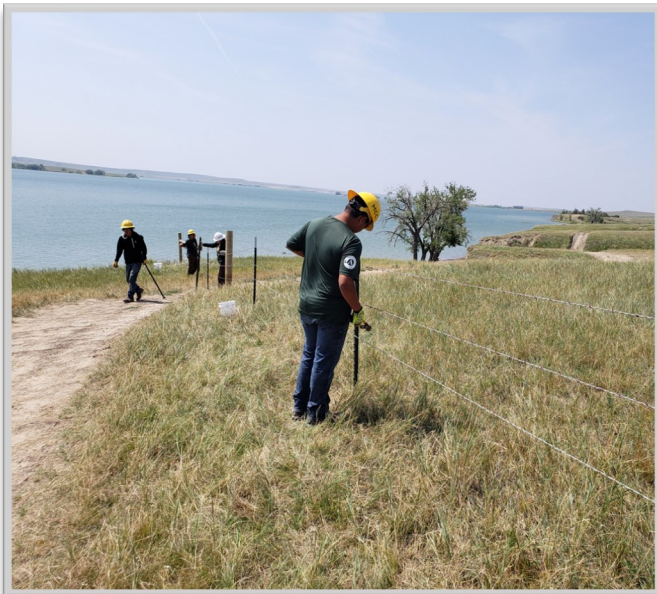
(Above) Montana Youth Conservation Corps removing internal fencing at Belle Fourche Reservoir in August of 2018.

For those of you who are new to our mailing list, the Bureau of Reclamation (Reclamation), in cooperation with the South Dakota Department of Game, Fish and Parks (SDGFP), continues to work on the Belle Fourche Reservoir Resource Management Plan (RMP). The RMP will serve as the blueprint for the future use, management and development of Belle Fourche Reservoir. This is the third newsletter regarding the Belle Fourche RMP. Newsletters are sent to provide information on the progress of the RMP.