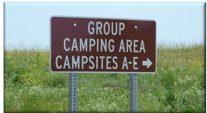
(Above) Designated camping sign.

Reclamation has the authority to implement a fee structure. All proposed improvements will be costly and implemented on a phased approach as funding and resources are available. As improvements are furnished to the public, Reclamation will analyze the implementation of a possible future fee structure on recreation areas without a partner, to recoup a portion of the capital investment costs. Fees may be implemented on a phased approach and adjusted accordingly as facilities/services are added. Fees would follow a similar structure to those of SDGFP to reduce confusion of multi-agency management.