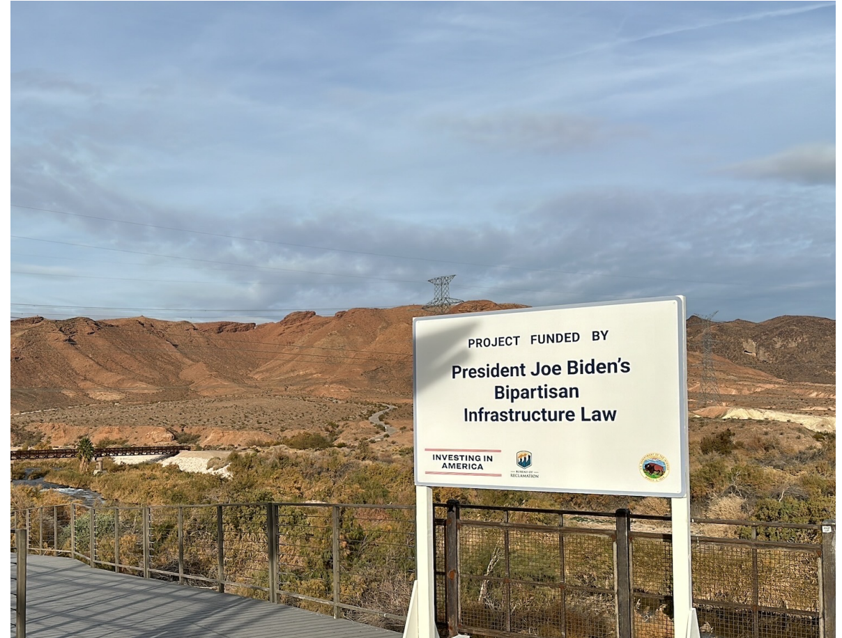
Las Vegas Wash Erosion Control Structure, Nevada, allocated $20 million from BIL under the Aquatic Ecosystem Restoration Program within WaterSMART. Photo from project site, December 2023.