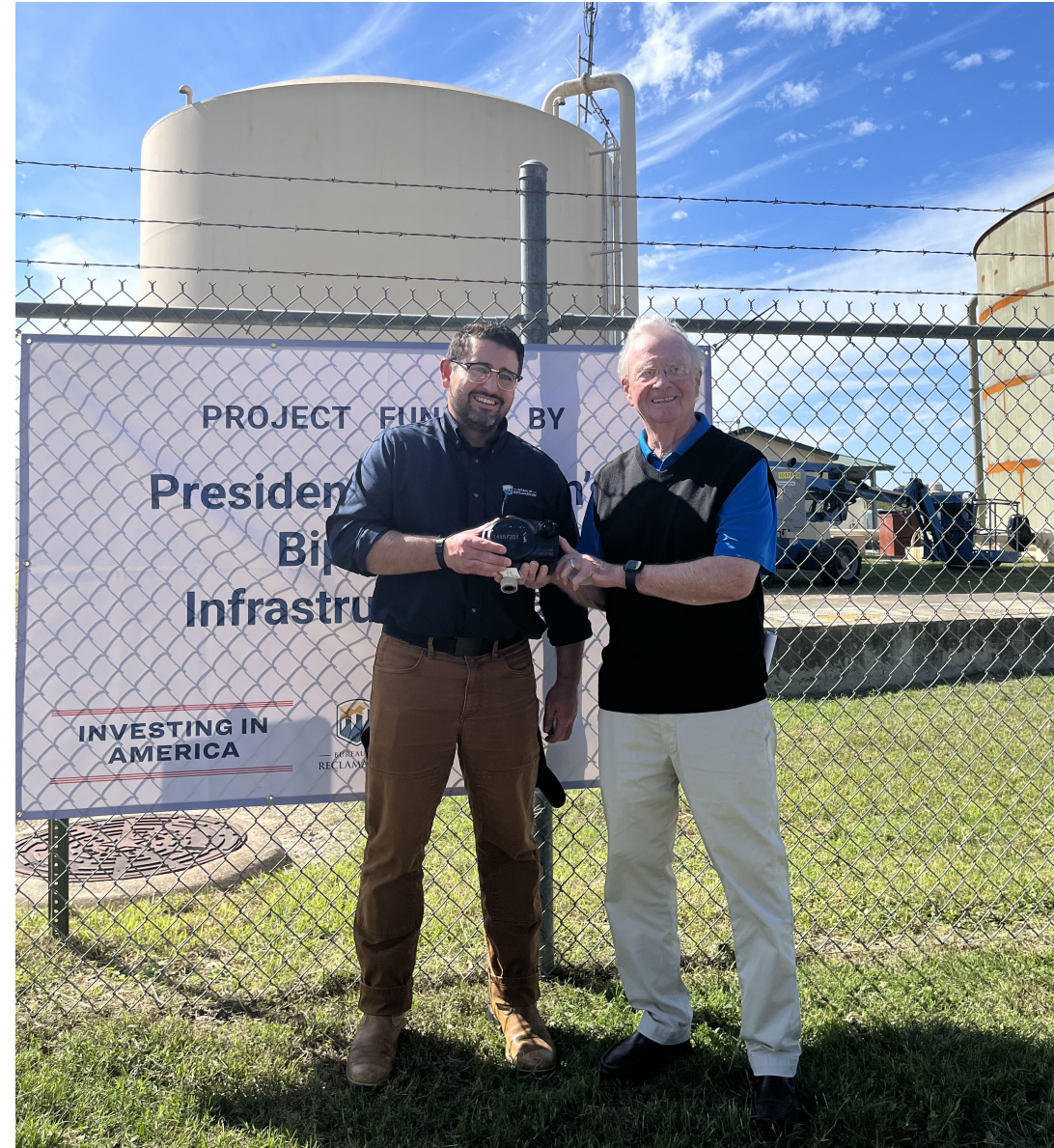
Universal City, Texas – recipient of BIL-funded WaterSMART Small Scale Water Efficiency Grant for advanced metering project. Site visit November 2023.