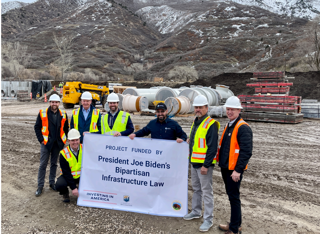
Davis Aqueduct Parallel Pipeline construction underway, Utah. Project allocated $23 million from fiscal year 2022 BIL Aging Infrastructure/Extraordinary Maintenance.