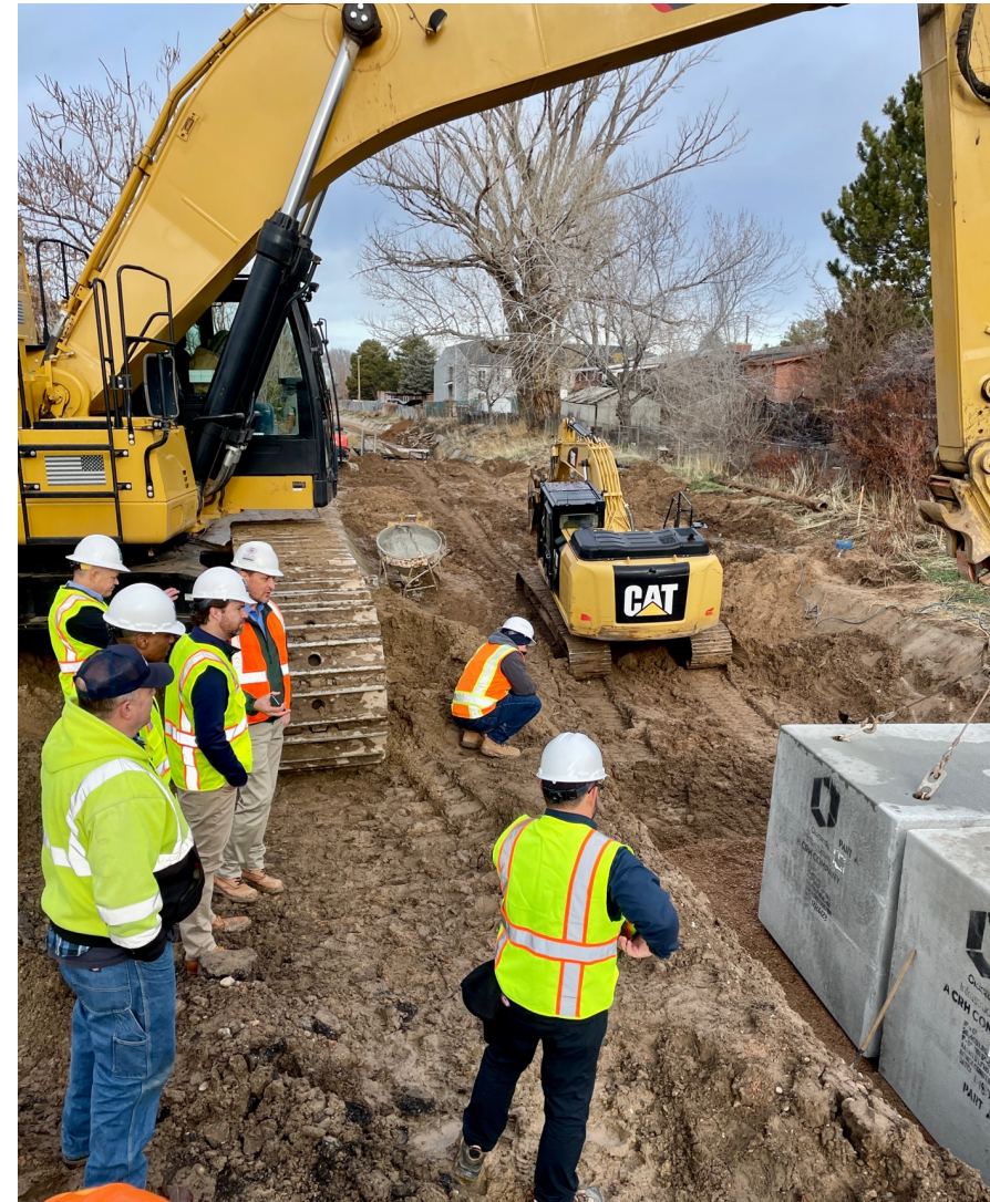
Davis and Weber Counties Canal Company, Utah. Project encloses 1,995 feet of open canal, funded with $1.8 million from BIL WaterSMART in fiscal year 2023. Photo from project site February 2024.