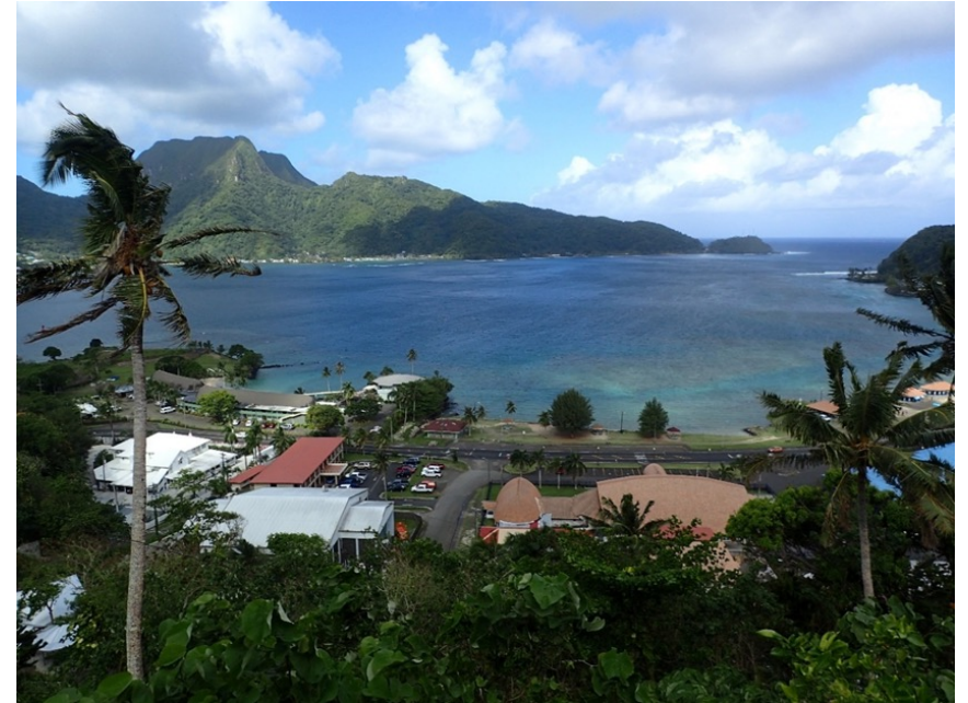
Pago Pago Harbor, America Samoa