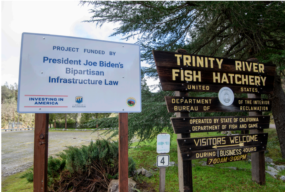
The Trinity River Fish Hatchery, California. Project received Reclamation's largest single allocation, $65.9 million, for Aging Infrastructure/Extraordinary Maintenance in fiscal year 2023. Photo from project site, December 2023.