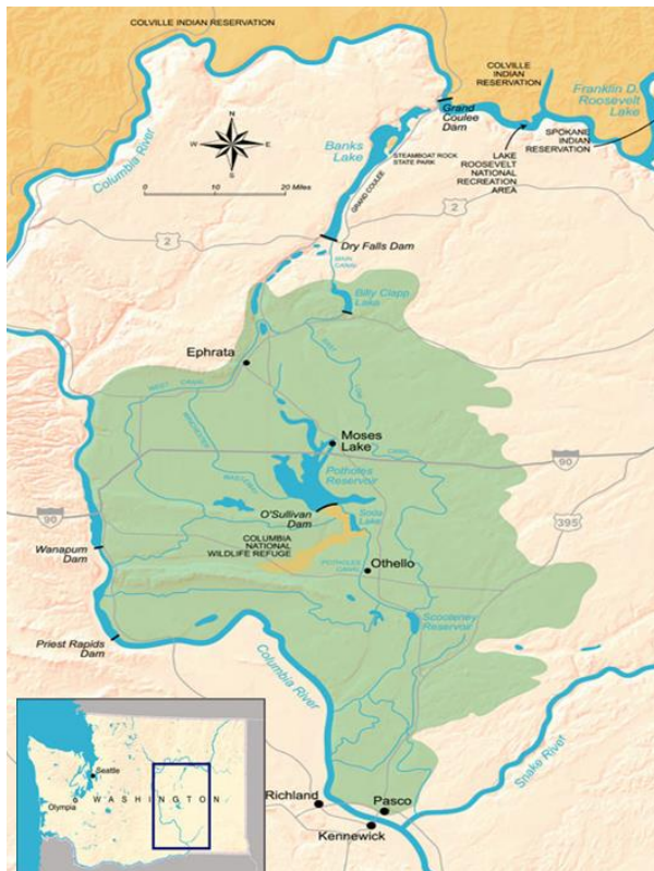
Location of Columbia Basin Project

The W38 lateral headgate is located at near the 38-mile marker on QCBID's main canal, known as the West Canal. This headgate is approximately 3 miles south of QCBID's headquarters in Quincy, WA. The coordinates for the W38 headgate are 47.1922° N and -119.8758° W.