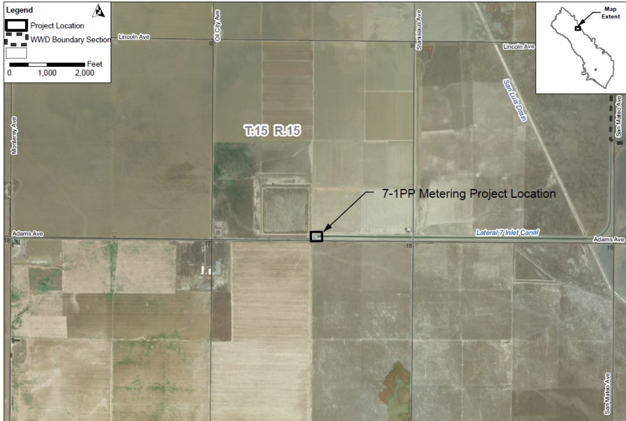
Figure 2. Project Location

The Project is located on the west side of Fresno County, California in a rural area approximately five miles west of Tranquillity, California ( Figure 2 ). The project latitude is 36°37'57.14"N and longitude is 120°20'33.37"W.