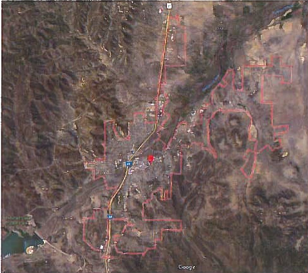
Figure 1 Google Earth map of the City of Trinidad

Trinidad is located at 37°10'15"N 104°30'23"W / 37.17083°N 104.50639°W / 37.17083; -104.50639 (37.170944, -104.506447). According to the United States Census Bureau, the city has a total area of 6.3 square miles (16.3 km 2 ), all of its land. Following is a map provided by Google Earth.