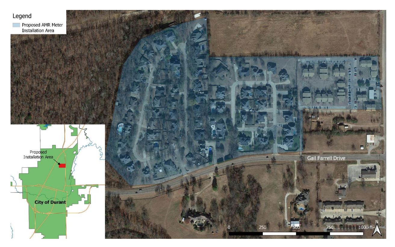
FIGURE 2. PROPOSED AMR METER INSTALLATION AREA

The project will provide an accurate method to better characterize water distribution system losses and through this allow the City of Durant to regain revenue due to water losses. Additionally, water conserved through leak reduction will result in beneficial effects outside of the City, with less water being taken from the Blue River, which is one of the few rivers in Oklahoma that does not have a reservoir on the main stem of the river.