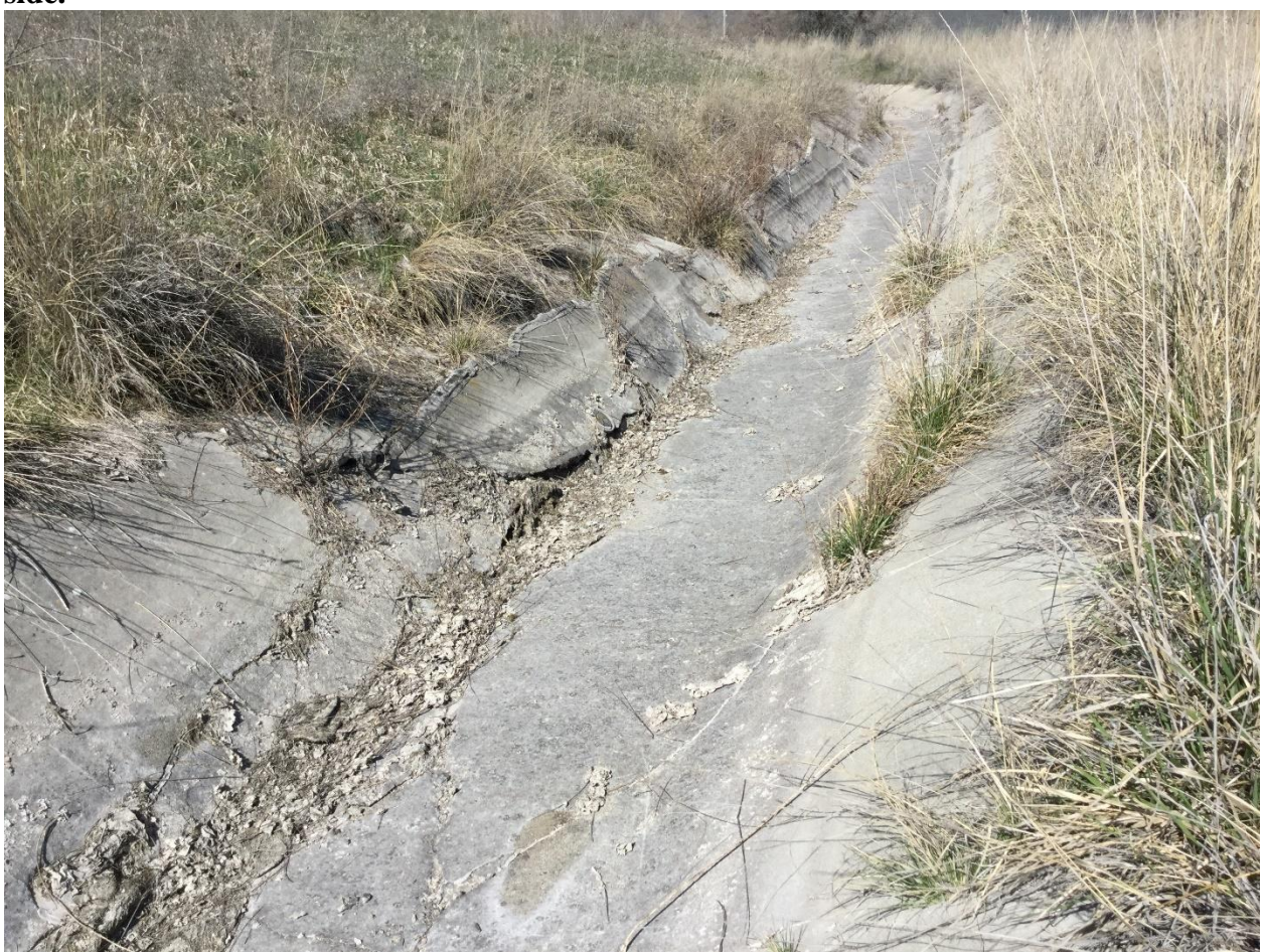
Below is a representative example of the existing canal, with significant cracks on the left side.

This project is a step towards improving water efficiency and pressurizing the entire system, which will lead to overall power savings. For small irrigation Districts, power and water efficiency is mandatory to maintain the long-term viability of agriculture in the area.