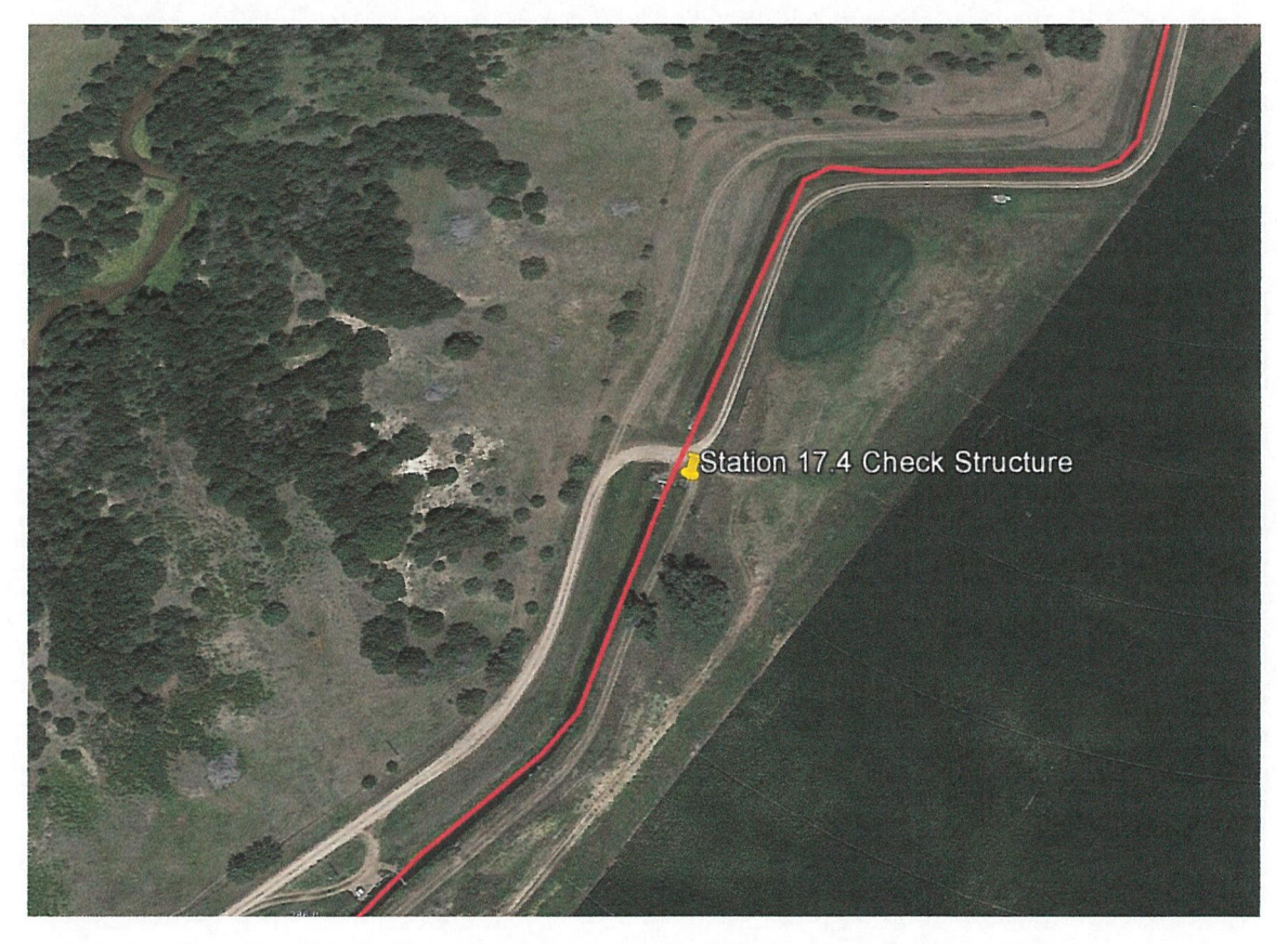
Figure 5 - 17.4 Check Structure and Upstream Waste-way (at bottom of image)

Another problem presented by the manual undershot gate is a lack of real-time flow information available to operators further upstream in the system. This lack of information makes it challenging to match flows upstream to demand at the 17.4 Mile Check, resulting in spill from the waste-way located upstream of the Station 17.4 Check structure.