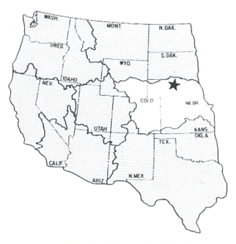
Figure 1 - Location of Ainsworth Irrigation District

The Ainsworth Unit is located in north-central Nebraska. The District's location is indicated by the star in the map in Figure 1 below.