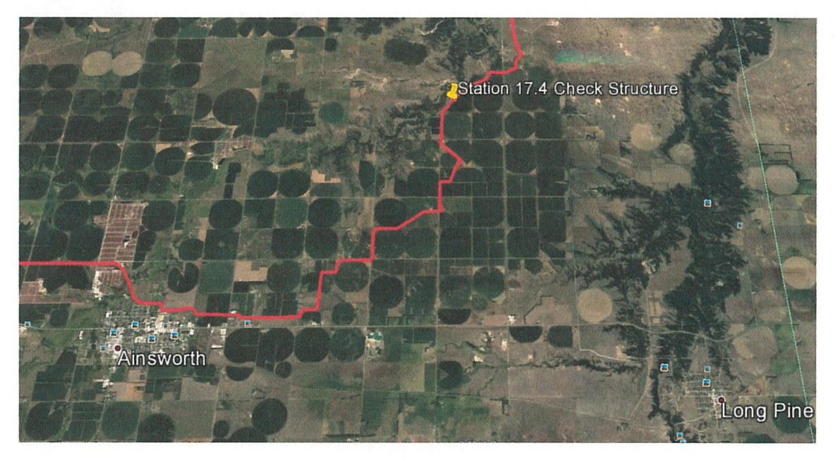
Figure 4- Location of Station 17.4 Check Structure

The check presently consists of a 4ft gate valve supplying a siphon which passes beneath a road crossing.