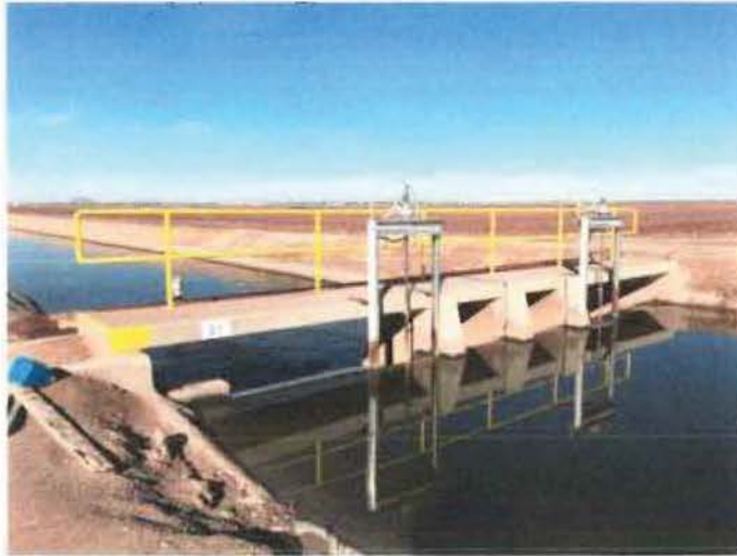
Figure 3. Check Structure #21 (similar to check #23 at Bruner Road which is to be automated).

This project will control the water levels in the canal to eliminate the spill. The water level at the downstream end of the canal, where the spill occurs, will be monitored and controlled by the operation of the gates at the Check Structure #23, the next check upstream (at Bruner Road).