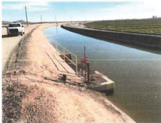
Figure 4. Inlet to the reservoir, over spillway (submerged in photo) and through the gate. Pumps from reservoir to canal are shown in background.

The water level upstream from Check #23 will be controlled with the inflow and outflow to the reservoir. Currently water spills into the reservoir over a weir if the water level is sufficiently high. There is currently a gate that controls inflow to the reservoir (Figure 4). If the gate is closed, no water can enter the reservoir. Under this project, a new automated gate will be installed for flow into the reservoir. If the water level is too high, the gate will be opened and water will flow into the reservoir (by gravity). If necessary, the overflow spillway crest will be lowered to allow better control into the reservoir with the gate that will be automated.