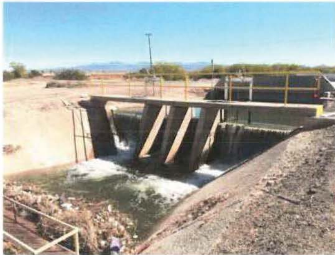
Figure 2. Check Structure #24 at the tail end of the main canal (Johnson Road).

Because of the lag time in the main canal, it is not possible for operators to match supply and demand with manual operations. RID currently spills about 5,000 acre-feet of water per year, or roughly 3.3% of their annual supply. RID constructed a small regulating reservoir toward the downstream end of the main canal (upstream from Check #23). Water spills over a weir into the reservoir when the water level in the canal is high. When demand downstream exceeds supply, a pump is turned on to pump water back into the canal. This does not directly reduce the spill, which occurs at the next check structure downstream (Check #24). RID staff has not been able to eliminate spills from Check Structure #24 at Johnson Road with manual operation of this reservoir. Figure 2 shows the location of the spill at Check #24 (Johnson Road) at the downstream end of the main canal.