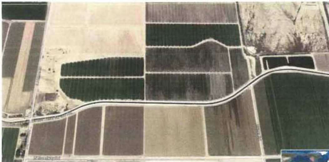
Figure 6. Layout of automation site. Flow is from right to left.

The site for the overall system is shown in Figure 6. The water level at Check #24 is controlled by the gates at Check #23. The water level at Check #23 is controlled by the combination of the inflow and outflow to the reservoir. Control with the reservoir is limited by the flow rates of the two pumps and restrictions of gravity flow into the reservoir (e.g., if the reservoir is too high, flow into the reservoir will be restricted). This system will be able to control minor fluctuations in flow. Larger fluctuations or long-term fluctuations will need to be controlled by District personnel further upstream. The capacity of the reservoir is roughly 400 ac-ft. It is roughly 15 ft deep. Long-term plans suggest a larger reservoir further upstream, which will be considered in the future (i.e., not part of this project).