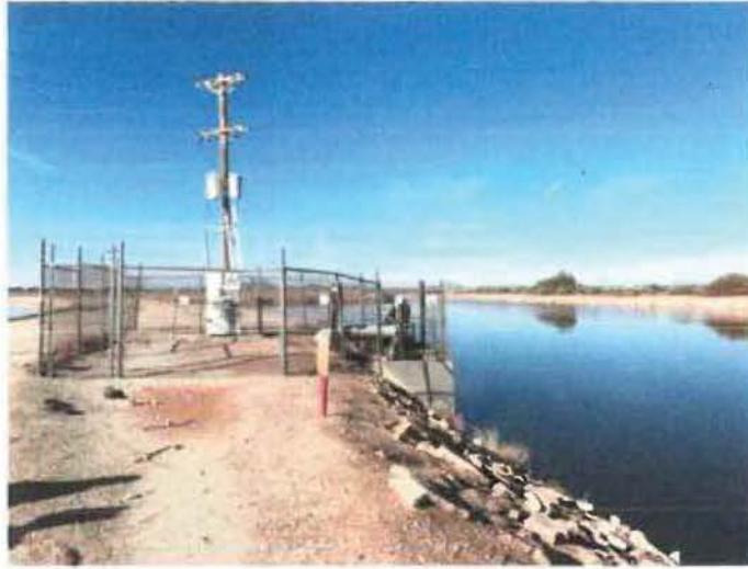
Figure 5. Pump station for pumping from reservoir (right) to canal (left).

If the water level is too low, the pump (Figure 5) will turn on to provide additional flow necessary to satisfy the demand downstream, and thus maintain the desired water level. There are two pumps that can pump water from the reservoir into the canal.