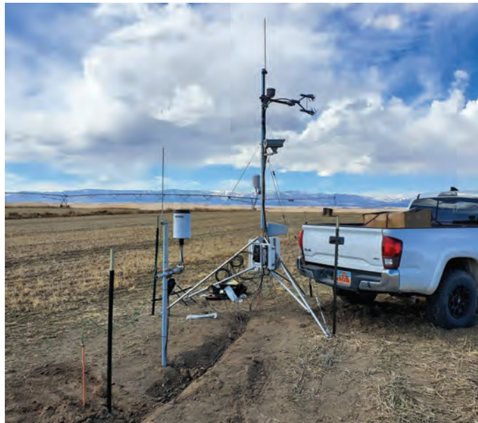
Wellington, UT eddy covariance station.

Paul Inkenbrandt Utah Geological Survey 1594 West North Temple Salt Lake City, Utah 84116 paulinkenbrandt@utah.gov 801-537-3361