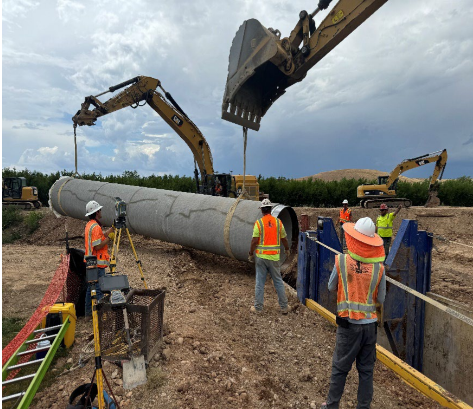
Photo: Contractors and a Reclamation inspector place a stick of pipe on the Utah Lake System Pipeline, UT 2025.