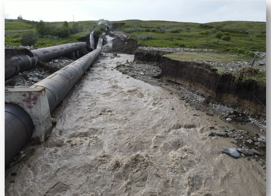
St. Mary Siphon's two 90-inch siphon pipes, which transport St. Mary Canal water across the St. Mary Valley, failed while diverting approximately 600 cfs.