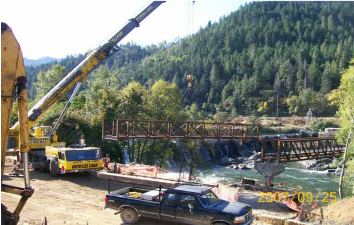
Savage Rapids Dam