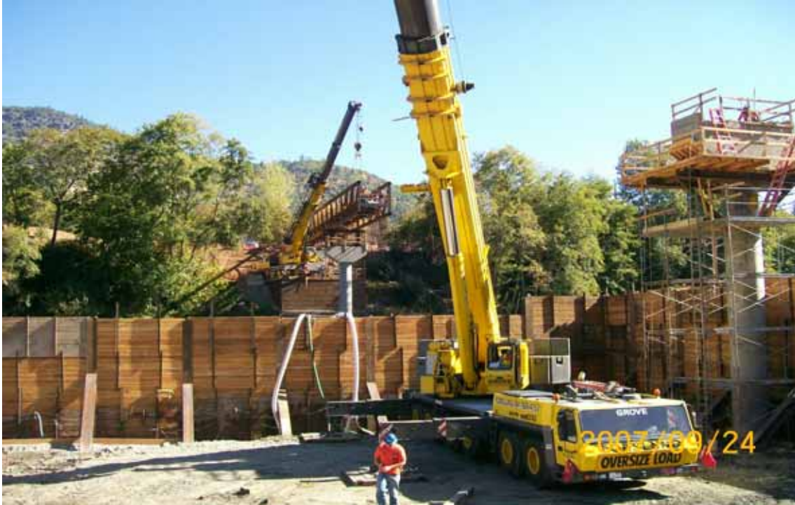
Savage Rapids Dam