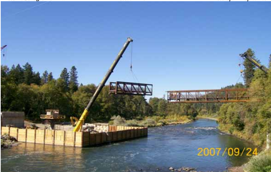
Savage Rapids Dam