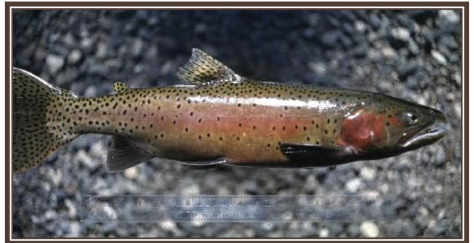
Lahontan cutthroat trout.

Generally, fluvial LCT inhabit small streams characterized by cool water, pools in close proximity to cover and velocity breaks, well vegetated and stable stream banks, and relatively silt-free, rocky substrate in riffle-run areas (U.S. Fish and Wildlife Service 1995). Fluvial populations of cutthroat trout including LCT appear to be intolerant of competition or predation by non-native salmonids, and rarely coexist with them