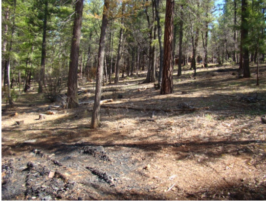
Figure 2 –Rancheria Site - looking North

Power would be provided to the proposed wells by the local utility company. The proposed well sites would be accessed from paved and graveled roads and residential driveways. The proposed project area would serve as the staging area for all aspects of construction activities. No vegetation removal would be required.