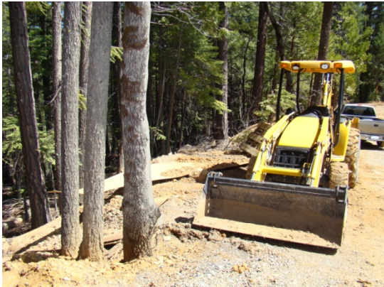
Figure 4 –Greenville Site B – looking North