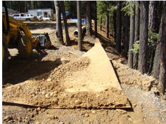
Figure 5 –Greenville Site B – looking South