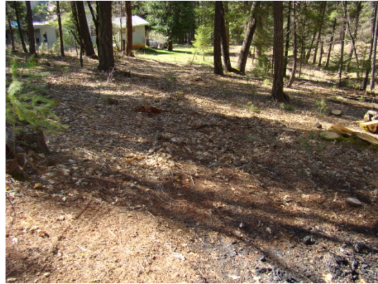
Figure 3 – Rancheria Site – looking South