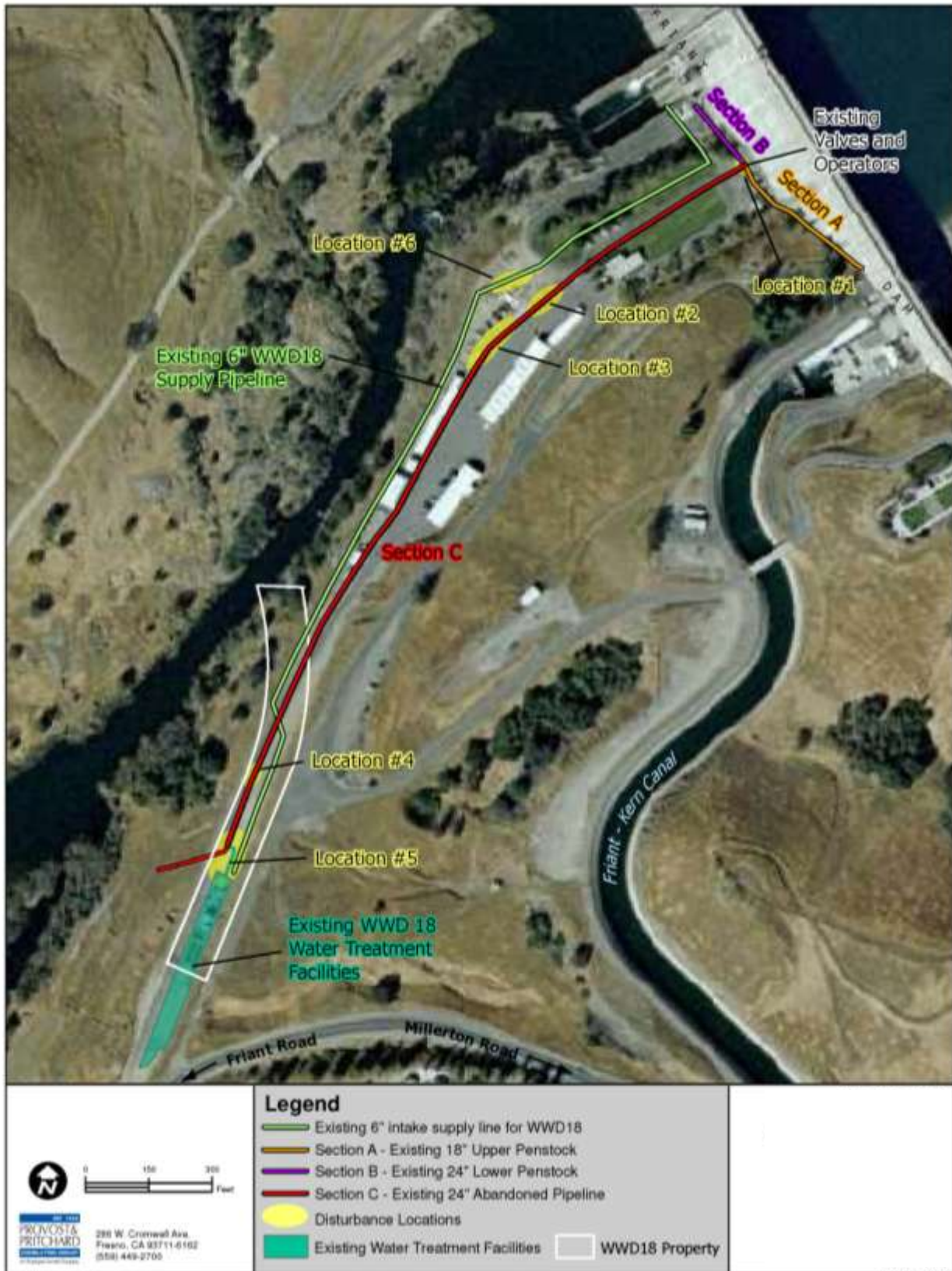
Figure 2-1 Proposed Pipeline Improvements